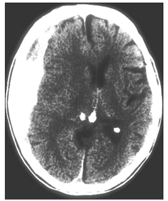
Figure 2. CT image of right subdural hematoma and secondary intracranial hypertension