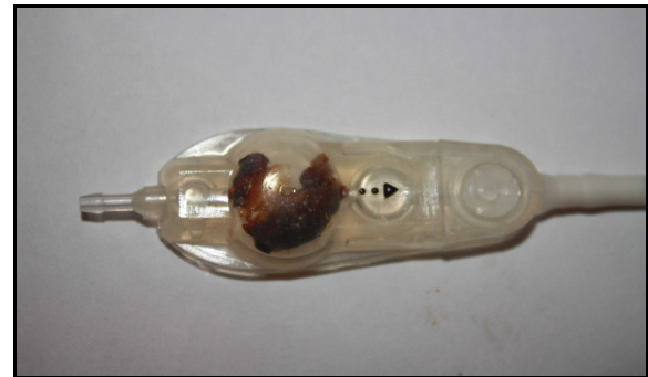
Figure 3 Valve occlusion