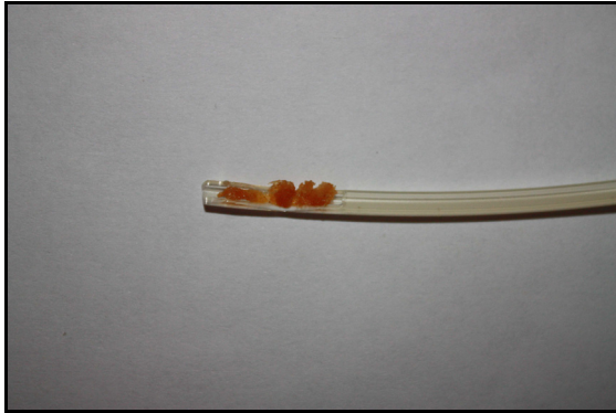
Figure 4 Distal catheter occlusion

Distal partial obstructions may be due to reduced absorption capacity of the peritoneal cavity. Most of these phenomena have clear origin (peritoneal infection, localized tumors), however many cases still remain unclear (immune reaction to drainage device).