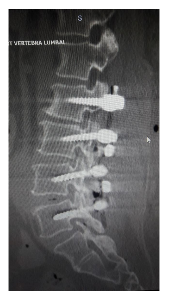
TABLE 2. The distribution of the screws used.