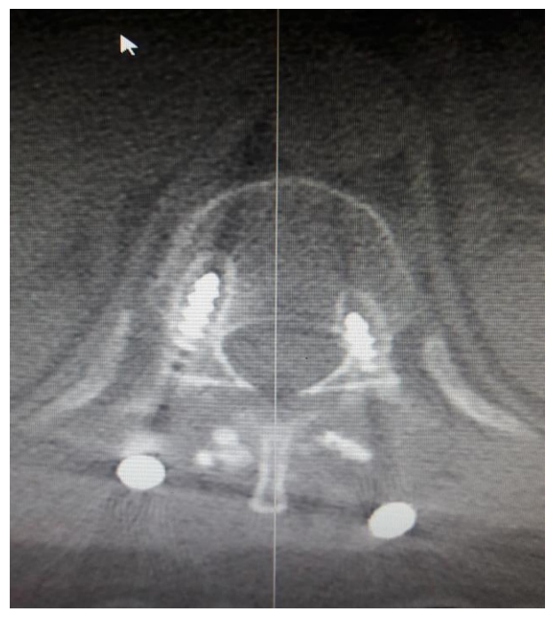
FIGURE 3. Left side T12 screw pull-out of a patient on the spinal CT axial image who was inserted a short and thin pedicle screw.