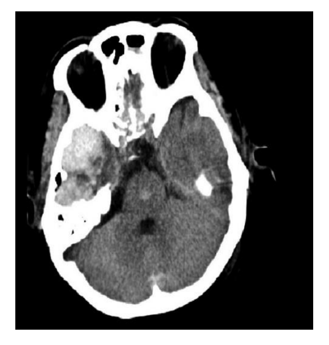
FIGURE 2. Postoperative CT scan verifying basally located remains of haemorrhagic contents and a subtle Duret haemorrhage in the pons.

hospital, unconscious with GCS 7 (1-1-5), present pupillary reflex, sedated and intubated. CT scan was performed revealing a skull base fracture, pneumocephalus, traumatic subarachnoid haemorrhage, small subdural haematoma over the right hemisphere and a small haemorrhagic contusion in right temporal lobe. She also suffered numerous smaller lung contusions. 24 hours later she was transferred to our institution due to a progressive oedema of the right hemisphere with an enlargement of the haemorrhagic contusion in the right temporal lobe. Decompressive craniectomy and evacuation of the haemorrhagic contusion was subsequently performed and the patient remained sedated for following 24 hours. A control CT scan revealed two subtle Duret haemorrhages (one located in the pons and one in the mesencephalon) both with a diameter of approximately 1 cm (FIGURE 2). No further surgical intervention was indicated. Two months later she underwent autologous bone flap replantation and a ventriculo-peritoneal shunt insertion due to development of a posttraumatic hydrocephalus. After the surgery she remained conscious with GCS 14 (4-4-6), disoriented with signs of organic psychosyndrome - slightly bradypsychic, occasionally agitated and verbally aggressive. Her only persistent motoric deficit was a right sided ptosis.