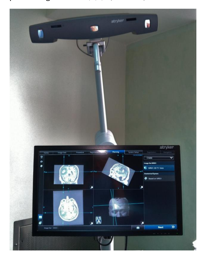
Intra-operative ultrasound . Ultrasonography (US) is a great mean of obtaining fast, cheap real-time images during brain surgery. Images are usually

when obtaining images and the position of the patient during surgery are almost never the same so the brain will have a shift during surgery compared to imaging. Another thing is that after beginning the excision of tumoral tissue, the landscape changes, but the images stay the same. Some solutions were developed for these problems. Other imaging studies may be performed intraoperatively to complete the preoperative study and to increase the of the neuro-navigation accuracy system. Intraoperative MRI is a known tool which performs the task well, but it is highly inconvenient. Its more readily available counterpart is intraoperative ultrasound. Tips for successfully removing tumours using neuro-navigation include: removing tumour tissue closer to eloquent areas first, when accuracy is better, performing en-bloc excisions as much as possible, avoiding cysts especially when they are large, until good accuracy is no longer an issue, "rebuilding" volume by placing cottonoids in resulting cavities. In spite of all issues, a surgeon will always find this tool useful and he will always have in mind the fact that he can never rely on solely this in performing his tasks.1,2,3,4 (PICTURE 4).