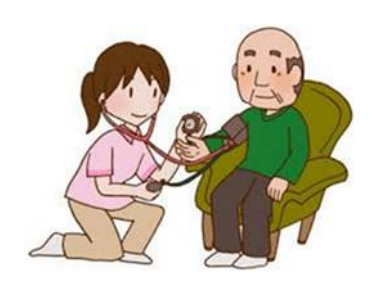
FIGURE 2 Vital sign measurement Medical interview