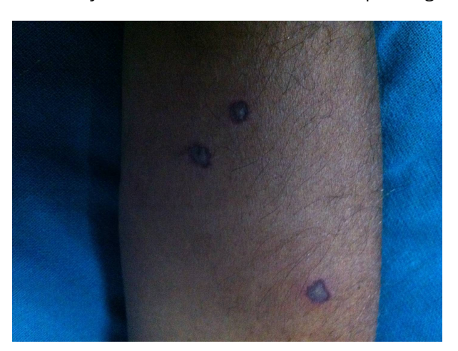
FIGURE 1: Hornet sting induced local erythematous changes in the forearm.

previously healthy farmer from the Dang valley in western Nepal was stung by around 100 hornets when he was collecting maize crops in his field. He was immediately taken to local hospital where he received chlorpheniramine (antihistamine) and hydrocortisone. The patient had fall in sensorium for which he was referred to our center. The family's medical history did not reveal thromboembolic disease or significant neurological and autoimmune rheumatoid disease. Upon arrival, his GCS was poor (6/15). Physical examination revealed multiple stings