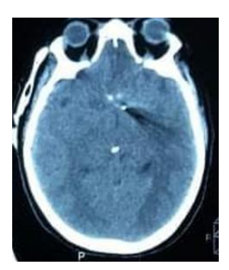
Figure 3. Postoperative CT scan, axial section, showing the location of AcomA clips as a metallic artifact.

Temporary clips were placed to regain haemostasis. Intra-operative neurophysiological monitoring (IONM), including somatosensory evoked potential (SEP) and motor evoked potential (MEP), revealed intact motor function in the right lower limbs and no findings of paresis that can be induced by the expected ischemia caused by the temporary clips. A final decision for permanently clipping the AcomA