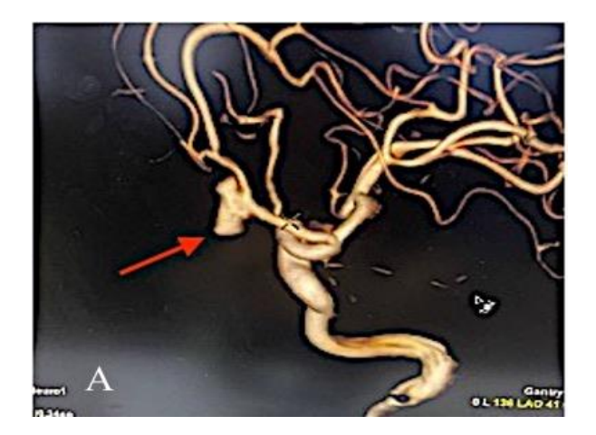
Figure 1. ( A ) (Pre-Operative) 3D constructed imaging of cerebral catheter angiography showing a right bilobed inferiorly directing anterior communicating artery aneurysm (Red arrow) with a superiorly directing Murphy's teat.

These events can be mainly attributed to unintended inadequate anesthesia, particularly muscle relaxants. Here, two suction catheters were used to control the bleeding with the application of temporary clips under a microscope. To be noticed, the permanent clips were moved after the IOR. Eventually, the clips were adjusted to include the whole aneurysmal neck, and the IOR stopped. This takes around seventeen minutes from the moment of rupture. Postoperatively, the patient showed a left-sided weakness grade of 0 on The Medical Research Council of Canada (MRC) scale. His postoperative CT scan showed a right distal anterior cerebral artery (ACA) territory infarction (Figure 1). The weakness improved to grade 4 over the next three weeks. At a 3-month follow-up, the patient was neurologically intact with the imaging showed no aneurysm.