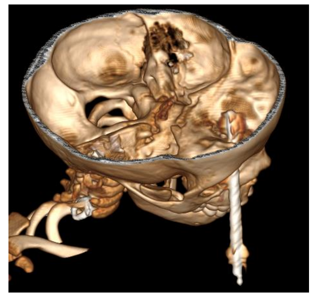
Figure 3. A 3-D CT scan revealed the penetrating injury in the anterior cranial fossa.

After an adequate preoperative examination, the patient underwent an emergency surgery. During the operation, the head was positioned for a pterional craniotomy with little deflection and greater rotation of the head by using the skull fixation device and an arcuate incision was made starting from the projection of the zygomatic arch anterior to the tragus in the length of about 15 cm and behind the hairline area. The dissection of the temporal muscle was done in the interfacial fashion.