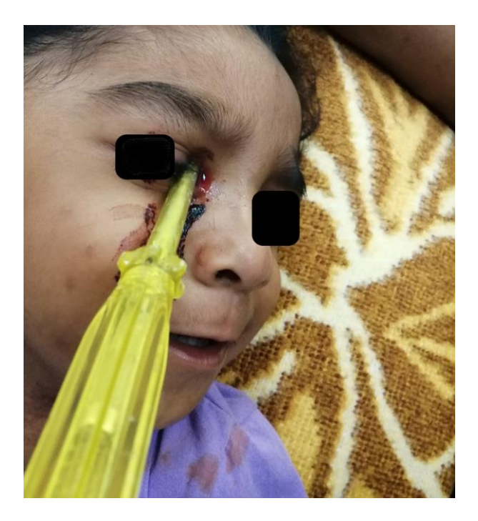
Figure 1. The metal part of the screwdriver passes through the medial part of the orbit.

The authors present a three-year-old female patient who accidentally sustained a PHI with a screwdriver through the right orbit (Figure 1). The patient did not lose consciousness or vomit after the injury. She was previously examined by an ophthalmologist and a pediatric surgeon at the local hospital. During the neurosurgical examination, on admission, the patient was conscious, oriented to time, space and person (Glasgow Coma Scale score of 15), cardiopulmonary stable, without any recorded gross neurological deficits.