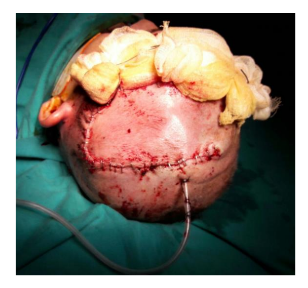
Figure 2. Closure of the case using frontal flap and soft subgaleal drainage with 10 ch drainage bag.

Figure 1. A case where the defect dural to firearm injury is too large that duraplasty cannot be made.