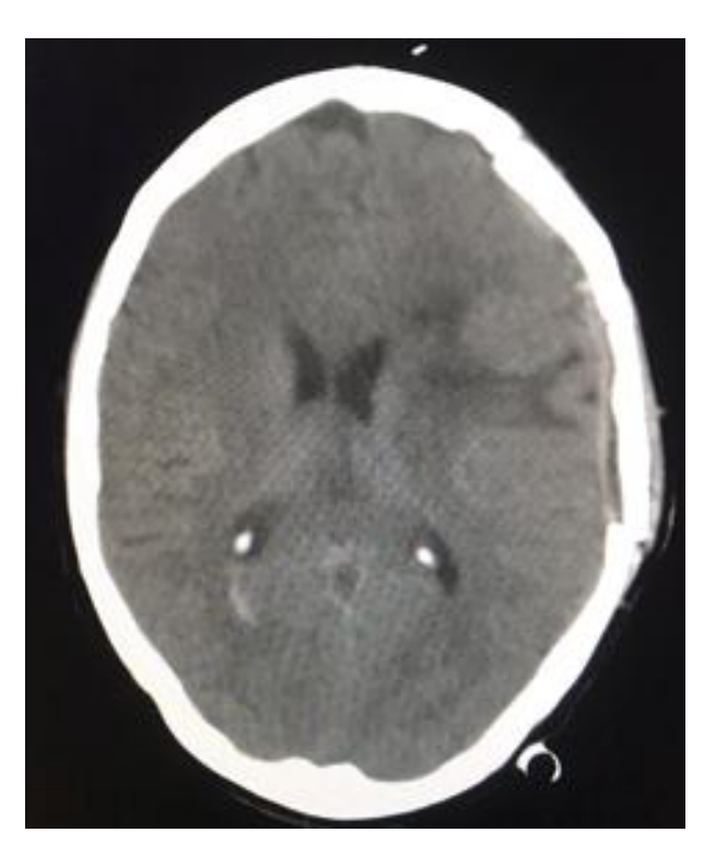
Figure 2. A non-contrast post-operative axial CT scan showing complete evacuation of the intracranial and intraventricular haemorrhages with a significant decrease in the midline shift.

intracranial hemorrhage (ICH), with significant midline shift and ventricular compression.