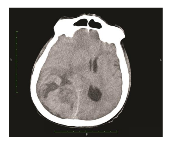
Figure 1. There was no osteolytic bone lesion in CT images.

HPC tends to recur, especially in primer surgical localization. Distant organ metastases are frequently observed 8. 5-year life after postoperative adjuvant radiotherapy has been reported as 57% 9. However, despite our patient's radiotherapy, relapse was observed after 3 months and was mortal.