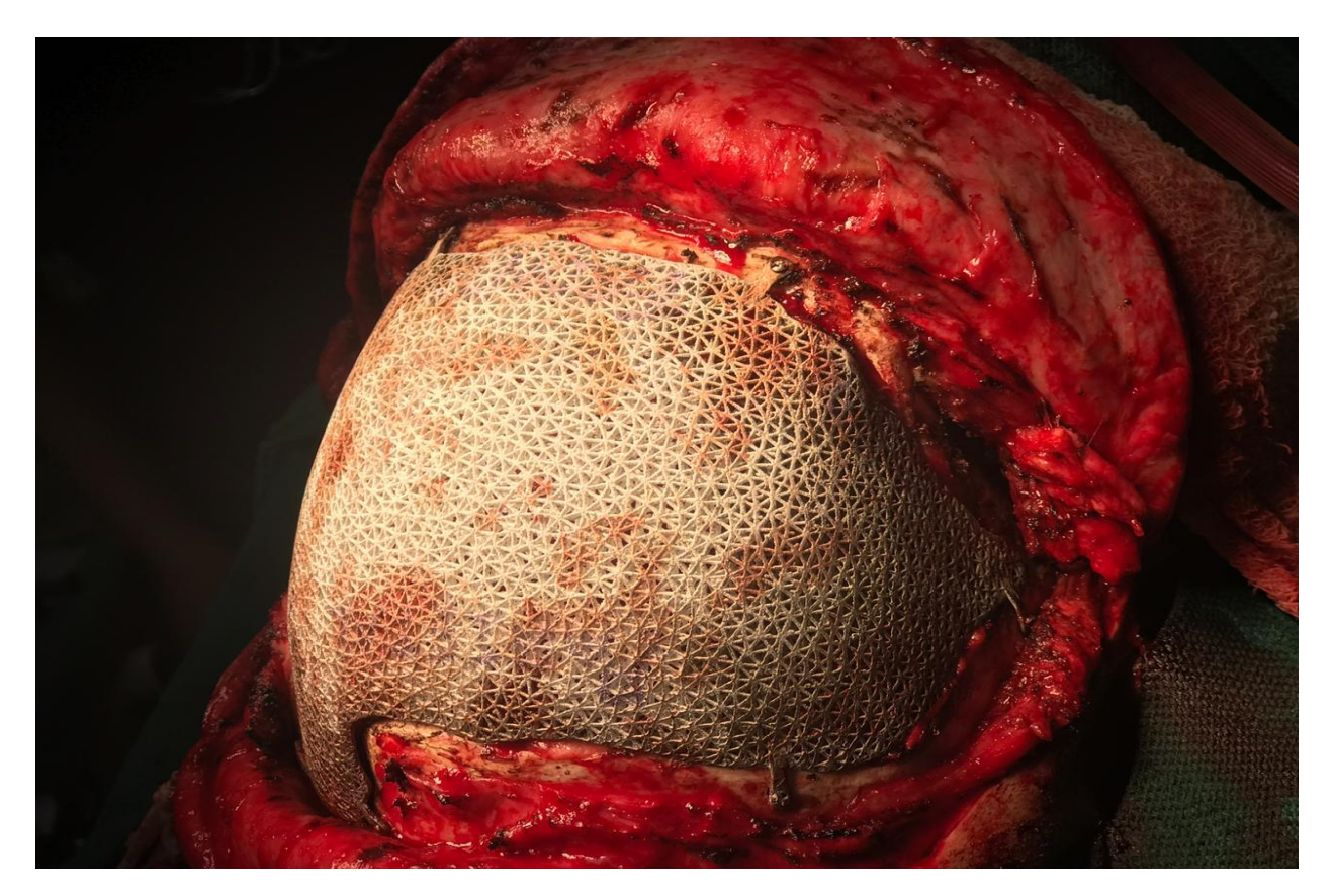
Figure 3b. Intraoperative photograph of 3D Customised cranioplasty flap of above-mentioned patient.