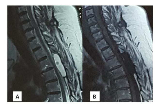
Figure 1 . Pre-operative spinal MRI shows a cystic lesion extending from lower edge of T2 to lower edge of T4 with hyper intense signal on T2-weighted MRI accompanied by a central hypo intense signal (A), hypo intense signal on T1-weighted MRI(B).

The spinal MRI showed a thoracic extradural arachnoid cyst from lower edge of T2 to lower edge of T4 and cervical spinal canal stenosis, the cyst is hyper intense signal in T2-weighted, hypo intense signal in T1-weighted and did not enhance on T1-weighted post-contrast (Figure 1 and Figure 2).