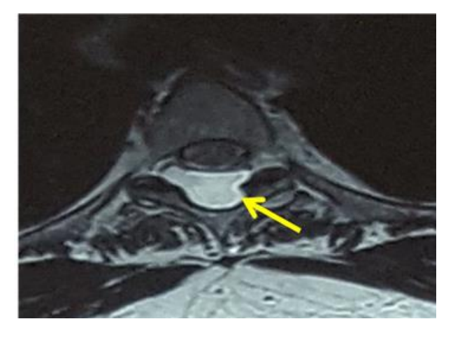
Figure 2 . T2-weighted MR imaging sequences showing arachnoid cyst with high signal intensity at T2 to T4 level.

We operated the patient under general anesthesia in