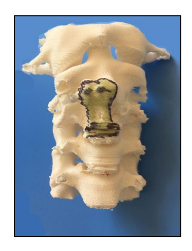
Figure 5 : 3D printed models for cervical spine planning approach.