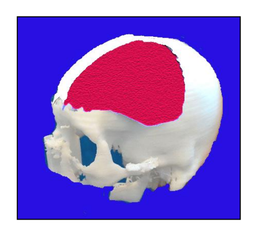
Figure 1: PMMA reconstruction on 3D printed model

the disintegrated defect. Subsequently, autologous bones were excluded and various acrylic or metal-based materials became increasingly used in cranial reconstructions. One of the disadvantages of these materials is the need to model them in situ during the operation, usually manually or with minimal equipment. These had to be cut and bent to fit, often reaching with sharp edges that represented a risk to both the surgeon and the patient's overlapping skin. All of these resulted in an extension of the intervention time and also created a number of problems, including poor match and unsatisfactory cosmetic result.