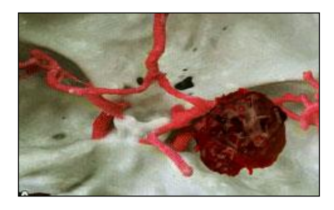
Figure 2 : 3D printed models for vascular aneurysm and sphenoid wigs tumour intervention training.

The main directions of neurosurgical pathology that have benefited from the advantages of 3D printing have been the provocative anatomy lesions, such as cerebral vascular malformations of the aneurysm or MAV, brain tumors, and techniques such as ventricular or transnational endoscopy, which involve visualization constraints. One area where learning has generally been limited in the operating room is aneurysmal blinking. With the large-scale introduction of the treatment of aneurysms by coil embolization and the lack of cadaveric tissue, simulation-based training has become an absolute must in the strategy of vascular neurosurgery training. Mashiko et al. using hollow elastic replicas of the different aneurysms from their vascular networks in a 3D printed model, they offered young neurosurgeons the opportunity to gain experience in selecting the appropriate clip, understanding the shape of the aneurysm and the direction of the clip [1,3,10].