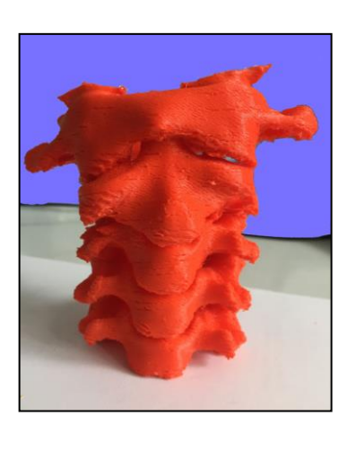
Figure 6 : Spine 3D printed model for assisting in the consent process.

Any medical procedure requires informed consent that involves a direct communication between the doctor, the patient and his family regarding the patient's condition, the treatment possibilities, along with its advantages and disadvantages, the consequences of the non-treatment, as well as the risks and complications of each form of therapy. [1,7]. Statistical studies have shown that each step of informed consent can be better explained and understood through the use of a tangible object, in other words by materializing an abstract concept.