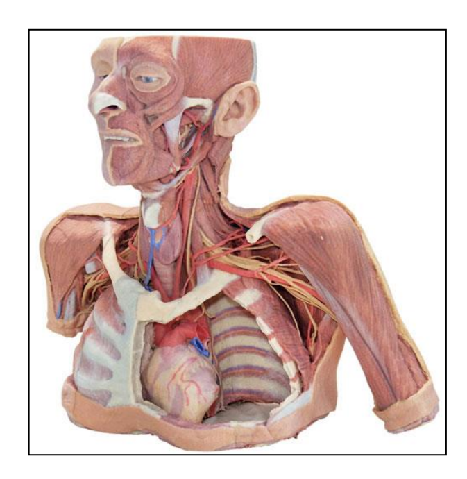
Figure 7 : 3D printed models for student medical education [10].

The use of plastic models as an adjunct to cadaveric dissection to demonstrate certain organs or skeletal anatomy is limited by their lack of anatomical realism and the lack of representation of the variation or pathology specific to the patient. In contrast, 3D printing techniques allow the production of precise models characterized by a great variability and particular anatomical normality, but also pathological. Unlike plastination, which presents the major disadvantage of the resources required to create anatomical models, 3D printing does not limit the amount of 3D printed models produced, depending on the number of original copies (Figure 7).