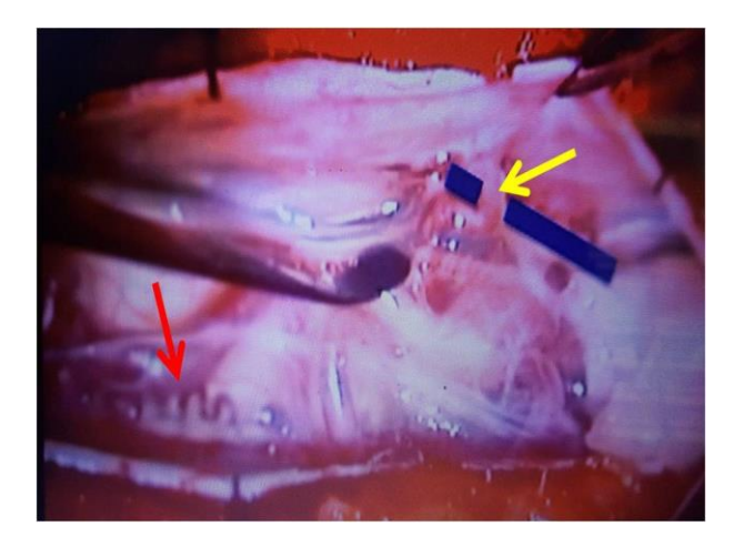
Figure 3: Per operative image, after durotomy showing the fistula (yellow arrow) and the tortuous varterialized veins (red arrow).

For all our patients we performed microsurgical approach; under general anesthesia, on prone position, a median skin incision is made at the level of the fistula; we perform a laminectomy one level above and one below the fistula to expose the work