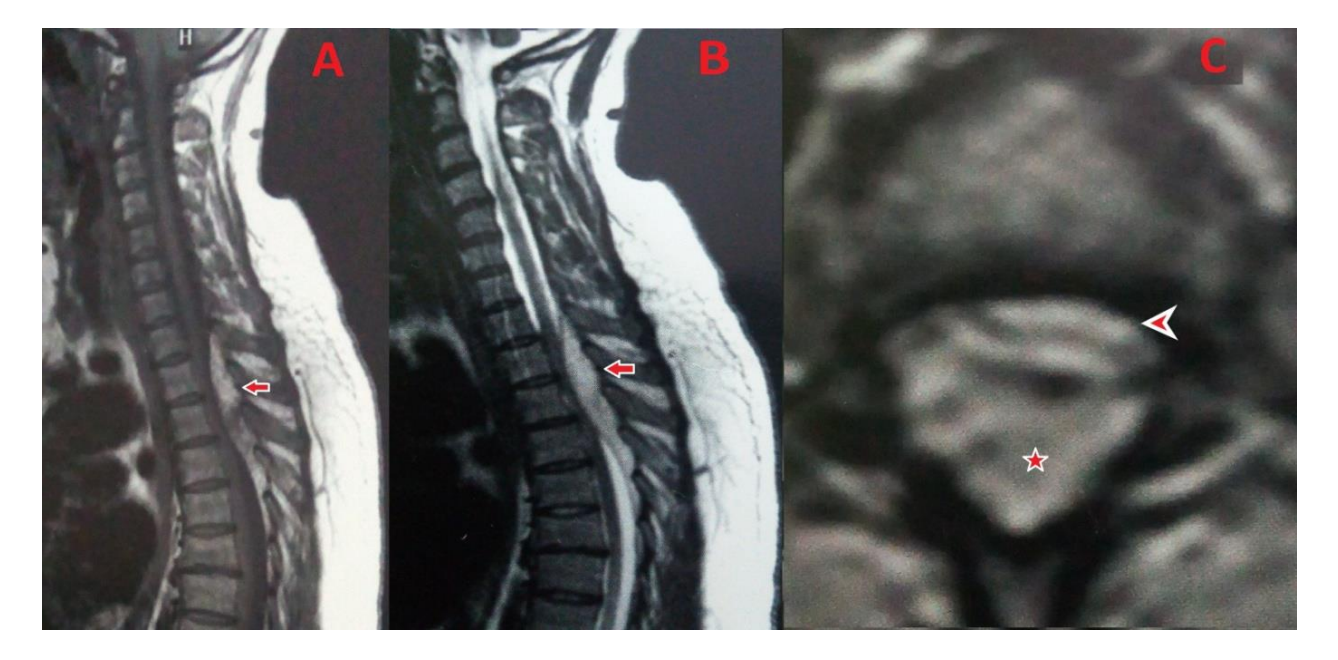
Figure 1 . Spinal MRI. A : sagittal T1 weighted image; B : sagittal T2 weighted image; C : axial T2 weighted image; showing hyperintense T1 and T2 lesion (arrows and the star) causing spinal cord compression (head of the arrow).

removed through a Th2 to Th4 laminectomy. The pathology study was in favour of an angiolipoma. Days after the operation the patient recovered totally, the weakness and the urinary urgency disappeared. The patient is flowed since 24 months she got pregnant.