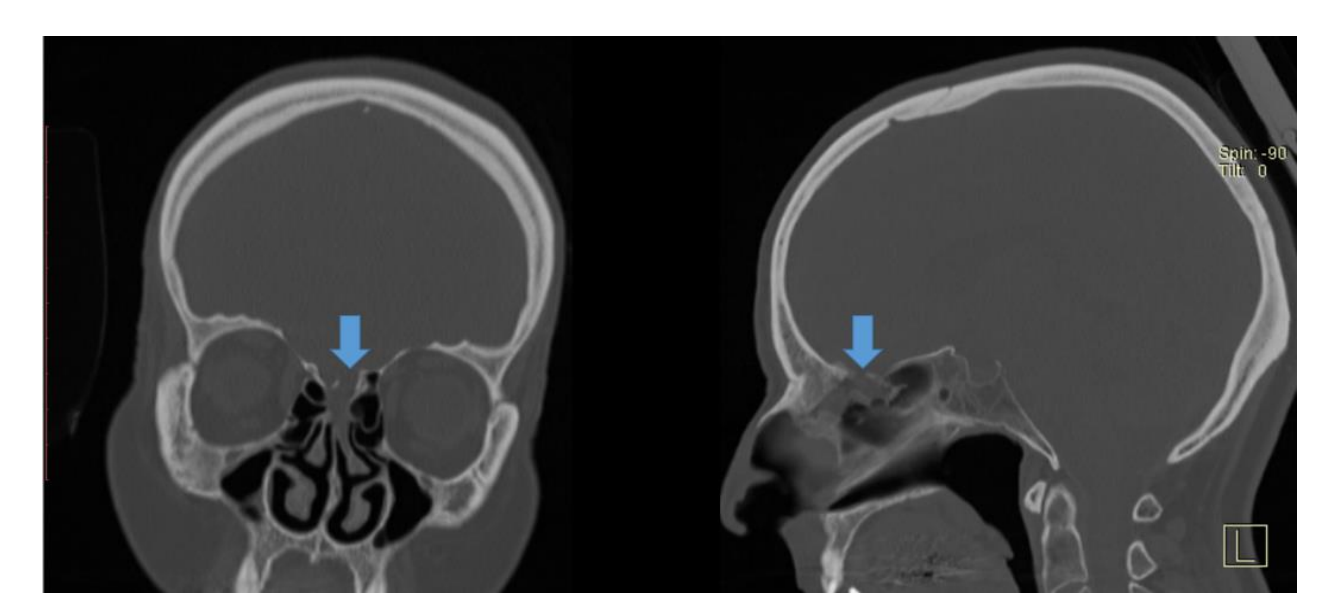
PICTURE 3. CT scan (bone window) showing mucosal thickening in the left cribriform plate in conjunction with the olfactory fila presenting defect in the adjacent skull base