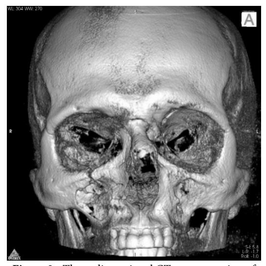
Figure 2 - Three-dimensional CT reconstruction of the same patient demonstrating the displaced fractures of the nasal bones and right inferior orbital rim, ascending process of the maxilla and anterior wall of the maxillary sinus