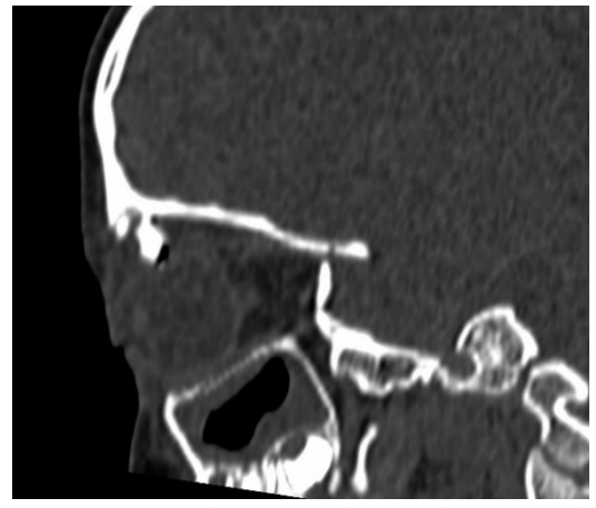
Figure 10 - Sagittal CT section showing the presence of the displaced intraorbital fragment causing pressure on the globe and on the superior rectus muscle