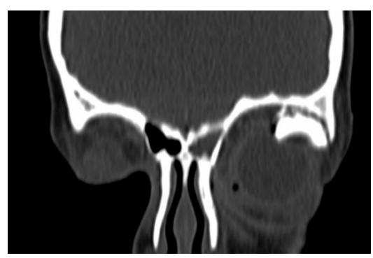
Figure 9 - Coronal CT section demonstrating the displaced left intraorbital fractured fragment impinging on the left globe and the superior rectus muscle