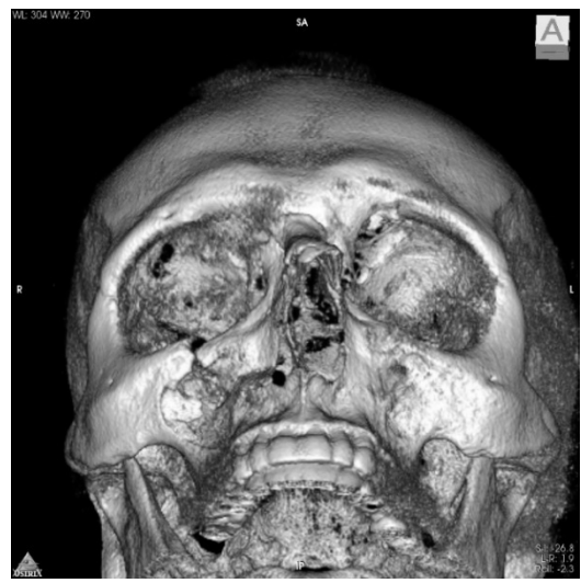
Figure 3 - Inferior view showing the inward and inferior displacement of the right medial fractured maxillary fragment comprising the inferior orbital rim and ascending process of the maxilla with orbital volume change