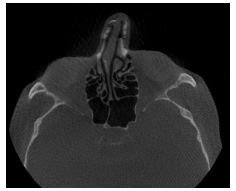
Figure 6 - Transverse CT section showing the displacement of the nasal fracture