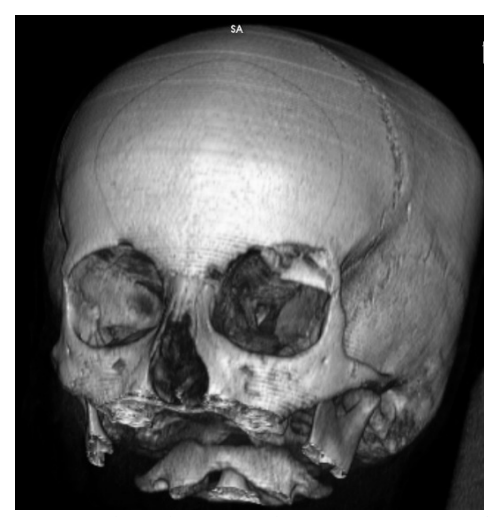
Figure 7 - Three dimensional CT reconstruction of a patient with a displaced fracture of the left superior orbital rim that necessitated a multidisciplinary management including a neurosurgeon and a maxillofacial surgeon

Severe neurosurgical lesions and ophthalmologic injuries may be encountered in conjunction with orbital roof fractures, consisting of brain injuries, pneumocephalus, dura tears, CSF leaks, pulsatile exophthalmos, orbital meningoencephalocele, entrapment of the extraocular muscles, globe rupture, optic neuropathies, retrobulbar hematoma (18). The morbidity is increased when there is association with other fractures of the orbital rims (Fig. 7-10), skull, skull base and facial skeleton. Orbital roof fractures, skull and skull base fractures in children require special neurosurgical surveillance, especially in cases where there is evidence of dural tears. This is due to the possibility of developing "growing skull fractures", needing early diagnosis and management for prevention of complications and sequelae (22, 23).