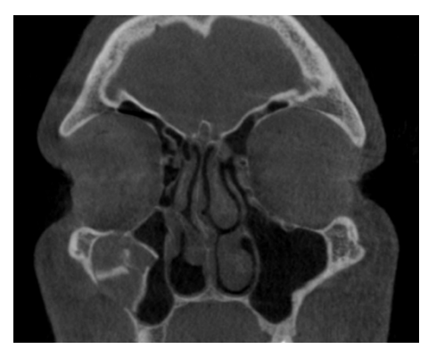
Figure 5 - Coronal CT section demonstrating right maxillary sinus fracture and hemosinus