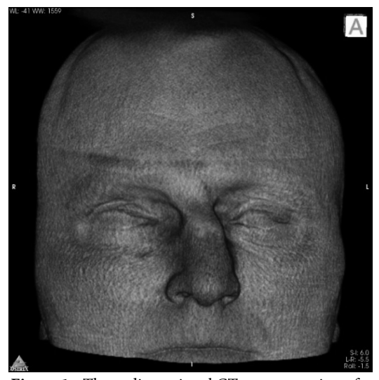
Figure 1 - Three-dimensional CT reconstruction of a patient with a displaced naso-orbito-ethmoidal fracture managed by a multidisciplinary approachsoft tissue frontal view demonstrating facial asymmetry due to left nasal displacement and orbital contour change

The maxillofacial surgeon is familiar with several types of access for repairing orbital fractures and complex midfacial fractures, such as the superior eyelid, inferior eyelid, transconjunctival, intraoral approaches, and the coronal flap offering exposure for the frontal skull, temporal regions, the superior, medial and lateral orbit (28, 4). The coronal flap is often used in mixed approaches for repairing skull fractures, frontal sinus fractures, superior orbital rim fractures, NOE fractures, and fractures of the orbital roof, particularly the blow-out type. The blow-in type of orbital roof fracture can be adequately accessed and repaired through an upper lid approach, in mixed surgical teams (29). Additionally, the closure of large CSF fistulas associated with tissue loss may be performed in mixed surgical teams, by using various types of pedicled or free flaps.