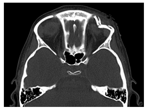
Figure 8 - Transverse CT section proving the intraorbital displacement of the left superior orbital rim fragments