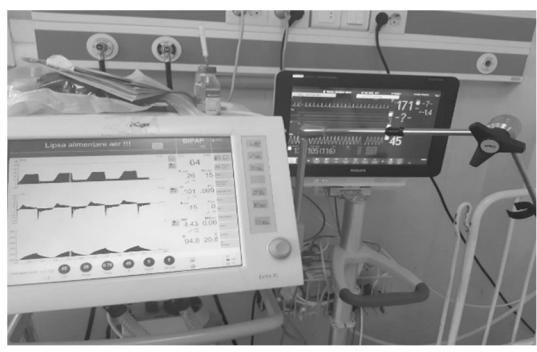
Figure 3 - Medical devices used for contiuous intracranial pressure monitoring