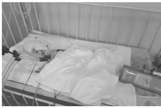
Figure 2 - The same case of a children with severe TBI and contiuous intracranial pressure monitoring