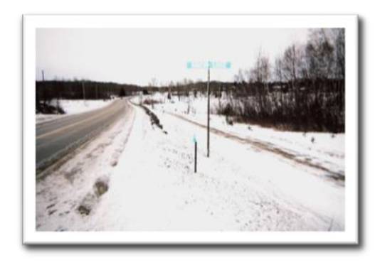
Figure 7. Two separate highways in NO.

MY travel ones...highway 69 bothers me...when I've kids traveling on that highway and I don't like traveling it myself... I find it stressful you know if someone isn't there when they are supposed to be there like I am vibrating, what is holding you up... that day [my daughter] was coming from [up north] with the two kids and you know it was right at the height of moose season, bear season and... I am sitting watching the clock...yeah that is not good [FP3]