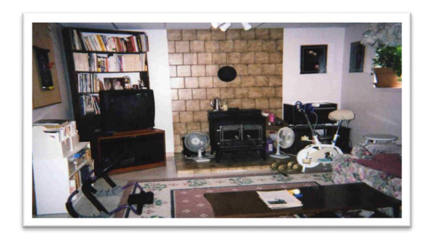
Figure 5. Living room scattered with exercise equipment

However, this participant also acknowledged that she could afford to buy exercise equipment to use in her home. This was apparent in the photograph of her living room where she would exercise (Figure 5).