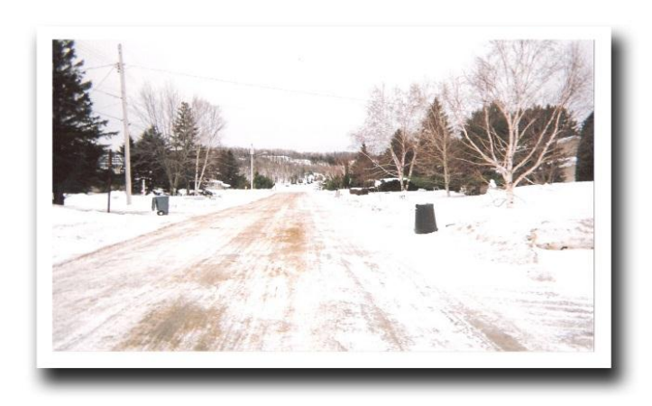
Figure 6. Snow Covered Road

This photograph represents a road within city limits and its physical nature involves connecting places. While a road is a place, it is also a path to places such as health care facilities, shops, malls, and gyms. Its use is often affected by poor weather conditions, especially during the winter when average temperatures are cold, snowfall is heavy, and harsh weather may last for months. Several participants acknowledged the challenges associated with transportation and climate in the north. One participant commented: