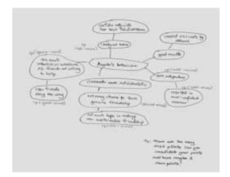
Figure 2. Sample showing a student's revisions based on peer comments. Note: rp refers to revision based on peers' comments, and tc refers to teacher comments. Categorizations in parentheses refer to type of revision made

consist of formal comments affecting the spelling of words. Text-base comments are based on the location of the idea being commented on. If the comment concerns a main idea, it is considered a macro comment. Addition macro comments add a main idea into the organizer, while deletion macro comments delete a main idea from the organizer. Substitution macro comments refer to comments where the peer deletes the original main idea and substitutes another main idea in the same location. Distribution macro comments refer to instances where the peer may want to change a main idea into a sub-idea of another main idea. Consolidation macro comments, on the other hand, refer to instances where the peer combines two main ideas to form a new main idea.