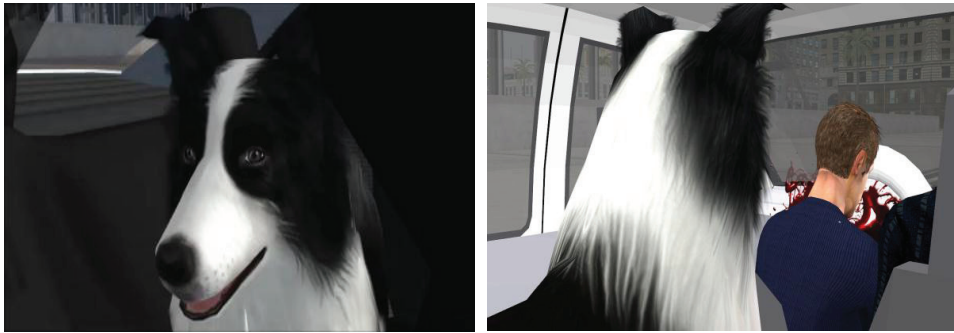
Figure 4. Virtual recreation of a real damaged motor vehicle and a physical representation of the dog.

introduction of background noises, such as a dog barking or glass breaking. Finally, a subtle musical soundtrack was threaded through the film to highlight events and tensions associated with actions on screen.