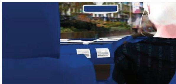
Figure 5. Editing and blending of ‘live action’ video film with avatar-based materials.

As formerly highlighted, there are numerous nodes and connections within the project, each one vital for ensuring the project is a live and immersive educational experience for pupils and students alike. It is perhaps easiest to first outline the obvious benefits to those experiencing the car crash scenario. Benefits to pupils/students include the following: