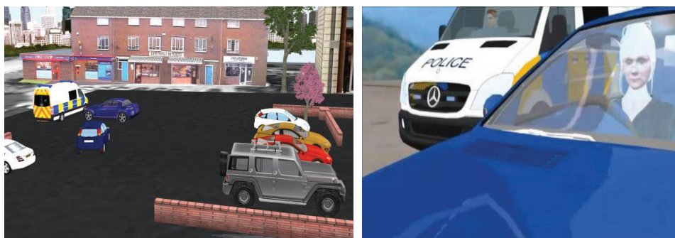
Figure 1. Challenging stereotype perceptions of offenders.

The avatar or virtual actor who represented the main protagonist in the film was designed to be physically similar in appearance to a member of the CrashEd team (Figure 3). By looking like a real actor in the simulation, associations could thus be made directly by students between the real actor (a lecturer in criminology who