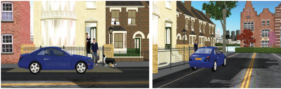
Figure 2. Design and development of a realistic community landscape in iClone software.

played the role of an unlikely offender), with the avatar whom they would later see on screen.