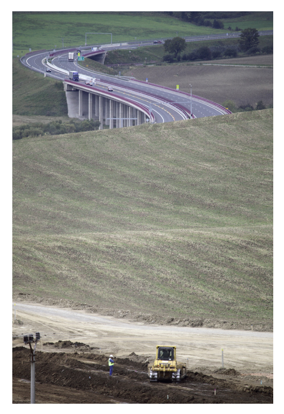
Figure 6 Purple color scheme in the new E50 near Presov (Slovakia)

Finally, we wondered if we were able to find a highway with the high level of spatial quality and attention to detail of an Italian piazza. I used to think of the German Autobahn as the climax of infrastructure designed as a public space: a highway owned, maintained and operated by the state, open and accessible to everyone, where no entrance fee is required, no toll is levied and speed limitations are the exception. A social space that is part of German culture and acclaimed in songs, for example in the 22 minute long hit single Autobahn by Kraftwerk: "Wir fahren, fahren, fahren, auf der Autobahn…" . (Hütter, Schneider & Schult, 1975)