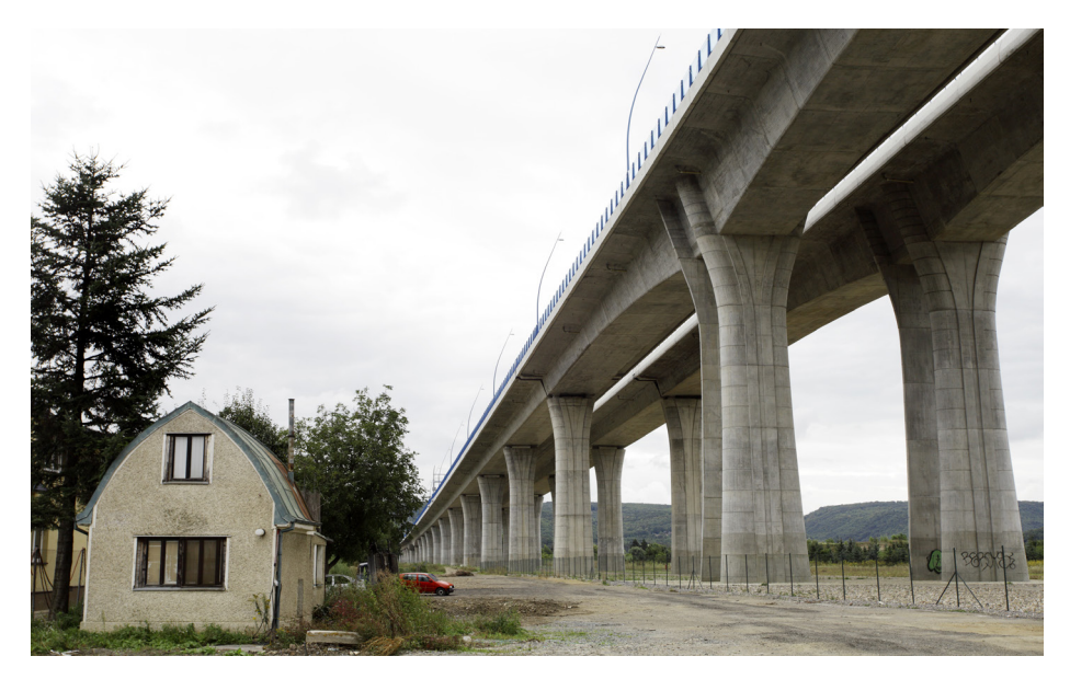
Figure 5 Built by Design & Construct: the new E50 near Prague (Czech Republic)

Traditionally, European long distance roads have been designed, built, financed, maintained and operated by the state. From the Via Appia and the other paved streets in the network of the Roman Empire to the Dutch network of 'rijkswegen' (main roads), initiated by Napoleon. In all European countries, the design and construction of highways was a state-run business, with state employed engineers and landscape designers. Only the actual construction was often outsourced to private companies. In some countries, this tradition is continued: in the Scandinavian countries, for example, and in Russia. In many countries though, not only the construction, but also the design, engineering, maintenance and often even finance is outsourced to private companies or public-private partnerships, for example in France, Poland, the Czech Republic and Slovakia (figure 5).