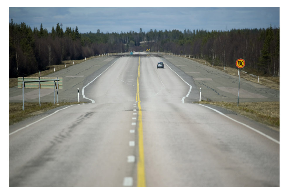
Figure 4 Landing strip in the E75 in northern Finland

Sometimes, it was even hard to find the E-route at all. The best feeling of one route was in countries where the E-number shares its route with a national long distance connection. In Finland, for example, where the E75 is called E75 all the way to Helsinki, the road serves as the main and sometimes only southbound route. Up north, where the E75 is occasionally transformed into a landing strip (figure 4), the route even feels like the European version of Route 66.