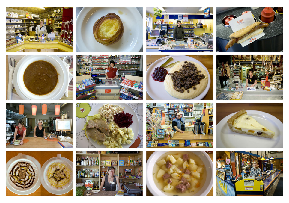
Figure 1 Food and the inhabitants of the E75

In order to introduce a framework for our observations, the following research method was agreed upon: we would travel one designated route and make an obligatory stop at every public space along the route, for example picnic areas, parking places, gas stations and roadside restaurants. Additionally, sleeping accommodations and food supplies were solely confined to motels and roadside restaurants along the route. During stops, the 'inhabitants' of the E-road, for instance shop keepers and waitresses, were subjected to interviews (figure 1).