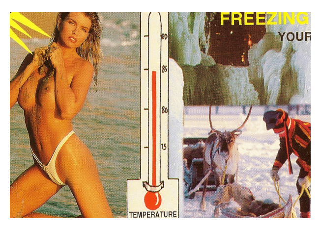
Figure 3 Postcard collected on the island of Crete (Greece)

As a source of evidence, we decided to ask the 'inhabitants' of the E75 and E50 (such as shop keepers, waitresses and border patrol) where the route that we were driving on actually ended. Nowhere along the E75 did we meet anyone who had any notion of the fact that this route links the arctic circle with the Mediterranean Sea, that it is an international route between Santa Claus and the sunny beaches of Crete. There was one exception to the rule: on the island of Crete, we were able to buy a postcard showing a photo of a topless girl on the beach and a photo of a reindeer in the snow, separated by a thermometer. The text on the postcard stated: "While I am sun tanning in Greece, you are freezing up north" (figure 3).