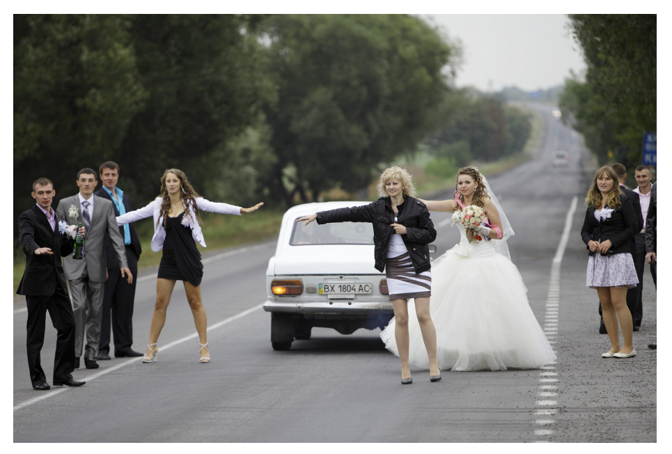
Figure 7 Newly weds collecting gifts on the E50 near Chmelnytsky (Ukraine)

The social significance of the Autobahn was equalled by an experience on the E50 in central Ukraine. We pulled over at a huge concrete landmark: a word in cyrillic script signifying the administrative border of the Khmelnytskyi Oblast (province). The sign itself was not that extraordinary: many regional borders in the Ukraine are marked by a large chunk of concrete from the communist era. Extraordinary was the fact that a couple of newly weds was blocking the road, urging passing vehicles to pull over (figure 7).