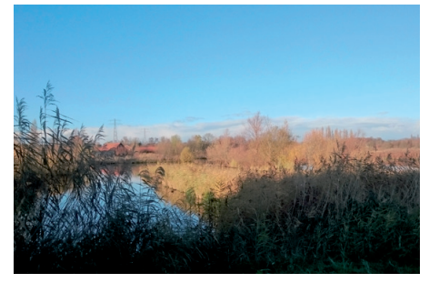
Figure 22. Nature nearby, Poelgeest. Figure 23. The reed field in the smallest polder of Poelgeest.

The first principle, landscape first, illustrates that by paying careful attention to the landscape and its surrounding ecosystem, nature-inclusive designers can arrive at innovative solutions that work with, rather than against, nature. This is what Bruno Latour refers to when expressing that we can no longer design our 'nests' without incorporating the habitats of what lives with us. We are part of the earth and expressing that in our design work is a viable option. Biodiversity can and will increase if we remain sensitive to it.