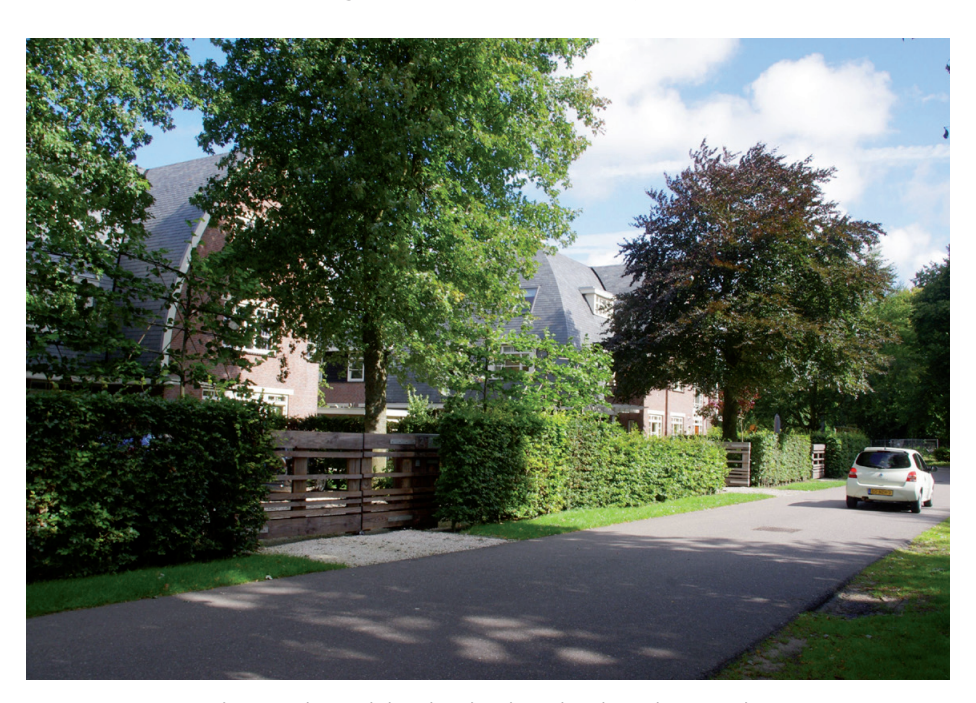
Figure 9. The neightbourhood Park Brederode on the east side.

The remaining tree groups, rich planting schemes, sight lines and path alignment are placed in a new landscape setting. More trees are planted and thick hedges line the fringe of the parcels (figure 9). In both projects, nature-inclusive design uses the surrounding landscape as a starting point to integrate human living spaces with a biodiverse ecosystem which has brought more endemic biodiversity to the site. The monotonous biotope of the sports fields was replaced by diverse, richer biotopes, such as a woodland, wild meadows and gardens that fit well into the ecosystem. The well-maintained hospital park biotope was changed into a fine grain mix of culture and nature. By studying the landscape to design and build with nature, the areas are now robust and accessible living environments for many species.