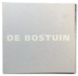
Figure 12. Woodlands in the neighbourhood Achter 't Holthuis. Figure 13. The Woodland garden manual , DS 2005.

In the neighbourhood Achter 't Holthuis, the houses stand in woodlands which are part of the public space (figure 12). Maintenance activities are organised by the communal gardening service as they have specific local knowledge of their own landscape. The woodlands cast a shadow over the gardens, something Dutch residents usually complain about. It is very common and, in such cases, inhabitants ask the community to cut down the trees. The "Woodland garden manual" was made to increase respect for the surrounding woodland and thus the tolerance to let it grow. Providing many examples of compatible plant and animal species, it also inspires newcomers to adapt their gardens to the surrounding ecosystem (figure 13). It lists beautiful, indigenous shade-loving plants that can be bought at the local nurseries and garden centres. To envision the look of a woodland garden, show gardens were made together with students from the nearby school of horticulture. The stewardship for the woodlands is an ongoing effort and it is crucial to give the landscape of woodlands, open spaces and lanes time to develop into a sustainable ecosystem.