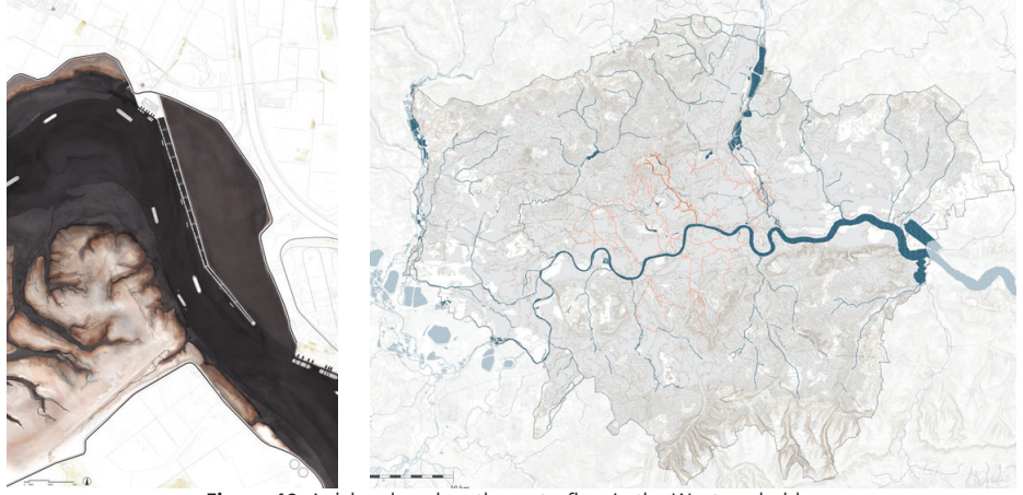
Figure 10. A dyke placed on the waterflow in the Westerschelde. Figure 11. Tight network of natural brooks under London.

With these blocks, a landscape can be made, offering new opportunities for ecology, spatial quality and landscape dynamics.