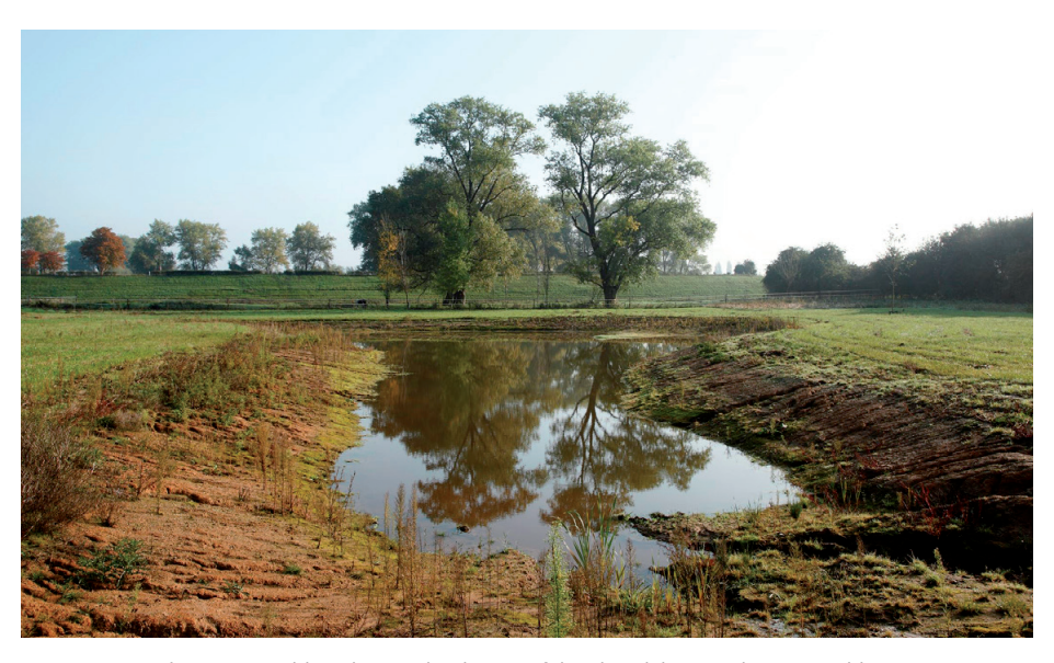
Figure 21. Building the new landscape of the Fliertdal.

From the perspective of the designer at DS landscape architects, four main principles provide important lessons to the field of building and designing with nature. Together, they illustrate that nature-inclusive design may require some extra work and thoughtfulness, particularly in the planning phase, but it also yields benefits that could well outweigh the investment. These cases do not bring forth a detailed cost-benefit analysis, but they certainly do draw the attention to values and yields that have not always been included in the equation. The quality of life of our human and non-human companions being a prominent example, the provision of ecosystem services another.