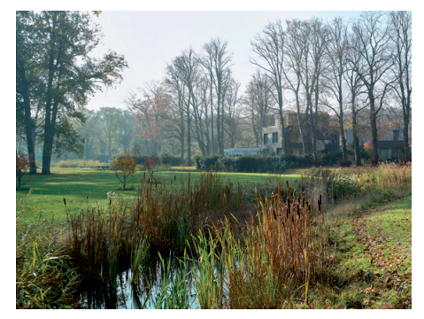
Figure 17. View on estate 'Hunderen' in Twello. Figure 18. The new brook in Park Brederode (image by Walter Herfst).