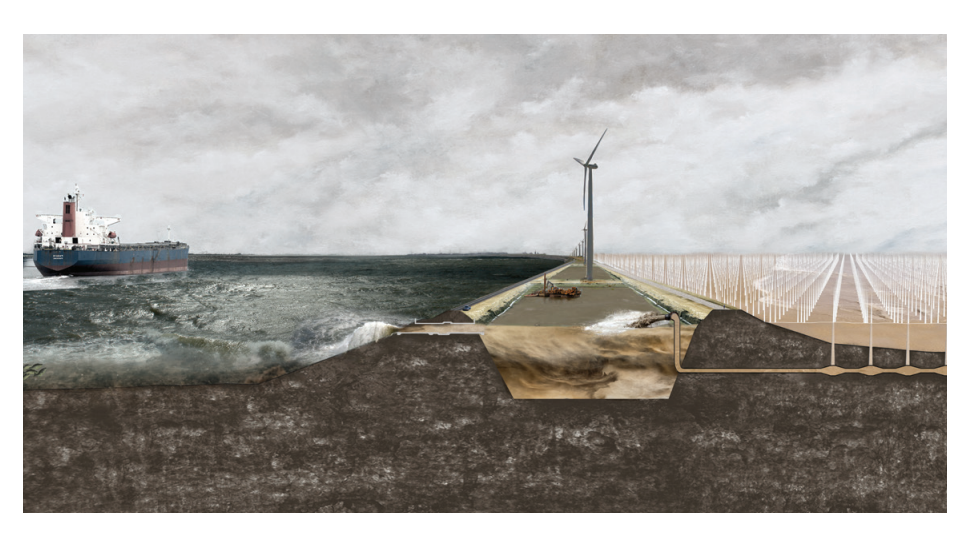
Figure 19. The working of the needle landscape expressed in crossection, Westerschelde.

saved and the landscape park is now a hotspot for birds and bird watchers. A colony of spoonbills is the finishing touch to make this area an attractive place to be and to care for.