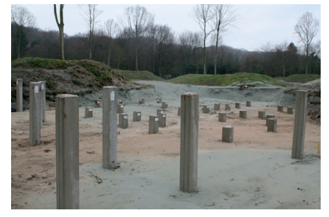
Figure 7. The new dune valley of Park Brederode. Figure 8. The villas in Park Brederode partially sunken in the landscape.

The remaining tree groups, rich planting schemes, sight lines and path alignment are placed in a new landscape setting. More trees are planted and thick hedges line the fringe of the parcels (figure 9). In both projects, nature-inclusive design uses the surrounding landscape as a starting point to integrate human living spaces with a biodiverse ecosystem which has brought more endemic biodiversity to the site. The monotonous biotope of the sports fields was replaced by diverse, richer biotopes, such as a woodland, wild meadows and gardens that fit well into the ecosystem. The well-maintained hospital park biotope was changed into a fine grain mix of culture and nature. By studying the landscape to design and build with nature, the areas are now robust and accessible living environments for many species.