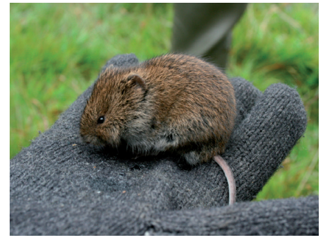
Figure 15. Fishing nets for the local children at the opening of Poelgeest landscape park. Figure 16. The root vole, protected species in Poelgeest.

This legislation will help the landscape to develop in time. A part of Brederode Park is designated as wilderness. For gardens in the dunes, a special regulation is applied, aiming to create conditions for wild animals to live there. It is called 'NLT- natuurlandschappelijke tuin'.