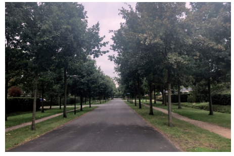
Figure 5. landscape built for the neighbourhood Achter 't Holthuis. Figure 6. A stretched lane of Achter 't Holthuis.

The estate landscape is known for its bats. The straight, stretched lanes connect the mansions, providing beautiful sightlines towards the valley and the mansions. They also offer hunting space for the bats around the estates. Furthermore, these lanes benefit the drainage of the area, opening up the flow towards the open spaces. These spaces are local floodplains where the common spadefoot toad finds its breeding ground. The woodlands benefit a range of local species at all levels of the food web. The buildings are part of the ecosystem as well, they are rocks in the landscape, a welcome habitat for humans as well as for some bee, bat and bird species.