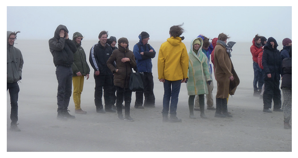
Figure 2. Public Expedition Zandmotor#2 Cultural Geology, March 2015, photo Theun Karelse.

Karelse offers the audience 'Fossils Soup', a culinary experiment that seeks to connect with the ice-age relicts through a direct sensory experience.