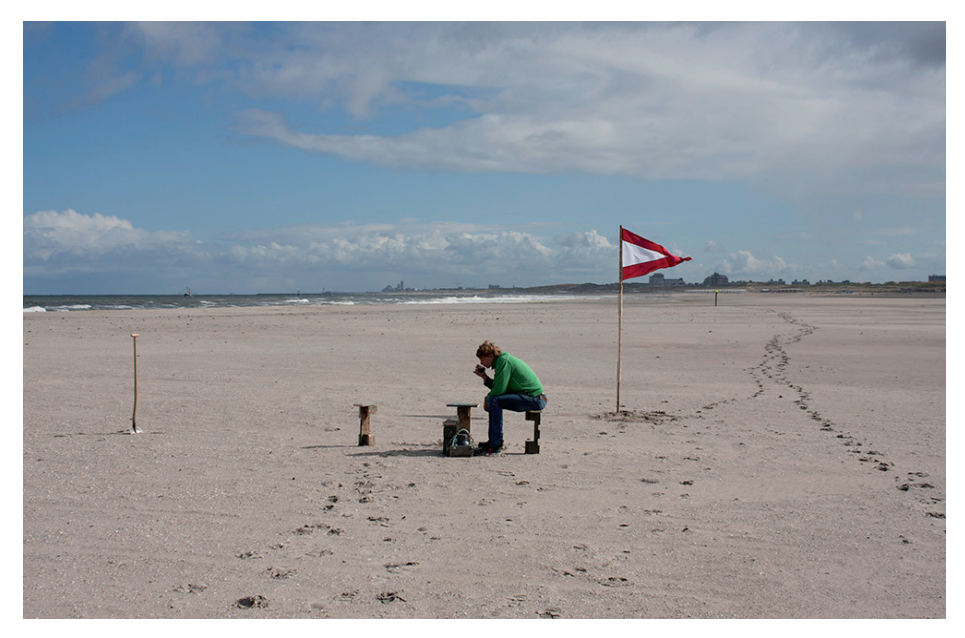
Figure 9. Maurice Meewisse, Eighteen Coffee Breaks - Eight Working Hours, Climate as Artifact 2018, photo Jacqueline Heerema.

'Eighteen Coffee Breaks – Eight Working Hours' is a triptych composed by artist Maurice Meewisse. He explores the relationship between the landscape, the local, and social history of the Sand Motor. The work is inspired by the creation of this hybrid landscape and aims to bring it back to a human scale. The Sand Motor is, in a way, an accomplishment of industry, the result of human endeavour even though it is experienced as nature. Meewisse introduced the coffee break, a very important daily ritual.