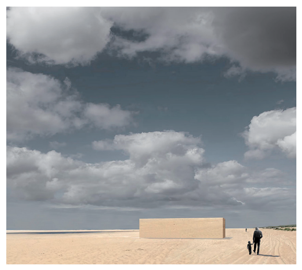
Figure 11. RAAAF, Rietveld Architecture-Art-Affordances i.c.w. Atelier de Lyon, Deltares, TU-Delft, Volker Wessels, proposed design Zandgast, 2015.

Henk Ovink, 1st Dutch Water Envoy commented on the design proposal of RAAAF: "The pavilion is the first real experimental upscaling of building with sand that RAAAF | Atelier de Lyon performs i.c.w. Deltares, TU-Delft, Volker Wessels. The quality of our country and landscape, of our cities, starts with the right match between safety and quality and it is that match that RAAAF | Atelier de Lyon embraces and is committed to a future perspective: temporary and adaptive, robust and natural, innovative and inspiring. The imagination speaks and makes the safety of our country really tangible in this sand pavilion." Eric Luiten, Advisor of Spatial Quality for the Province of South Holland (2009-2012) added: "Sustainably manufactured, explicitly architectonic, merges with the harsh environment. Very delightful. Robust, manageable, tenable in harsh conditions and at the same time understandable as temporary. Uncommon, stubborn, interesting."