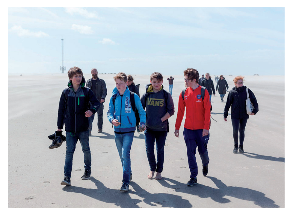
Figure 10. Sand Motor as learning experience for public climate-consciousness, Public Expedition Sand Motor #14 Timescale of Landscape, April 2018, photo Florian Braakman.

"Dears, storm today: so great for filming, and possible some rain; no worries, I made a shelter for us this morning and prepared another experiment. See you there at 14:00" as Cocky Eek, artist-tutor of ArtScience Interfaculty texted to the students of the ElementsLab. Challenged by the ongoing artistic field research and public expeditions program, the need for a modest, sustainable and inclusive Sand Motor 'shelter' arose. A space to explore, collect, share and learn on-site from the ongoing outdoor artistic and scientific experiences, with the Sand Motor and with the public.