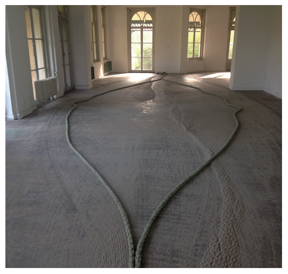
Figure 4. Zoro Feigl, Untangling the Tides, Public Expedition Sand Motor #1 Sand Drift, Villa Ockenburgh November 2014, photo Thijs Molenaar.

Feigl is fascinated by why things work the way they work, why something moves the way it moves: "On the Sand Motor I had a work in mind, something that could compete with this sand plain, a work that could enter into a conversation. In the many walks there I noticed that the small details in this wild-water desert fascinated me the most. The patterns in the sand, the waves. The drawings that the wind and water make. The size became an obstacle. That's how I started to highlight and iso-late the pieces that fascinated me. Playing with these small things eventually became the artwork 'Untangling the tides' with two ropes, the ends of which are attached to small revolving motors, creating a hypnotic effect."