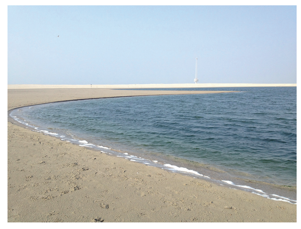
Figure 1 . Sand Motor, 'The Dutch are masters in disguising a cultural landscape as a natural one. We tend to design, construct, reconstruct nature to fit our needs', quote and photo Jacqueline Heerema.