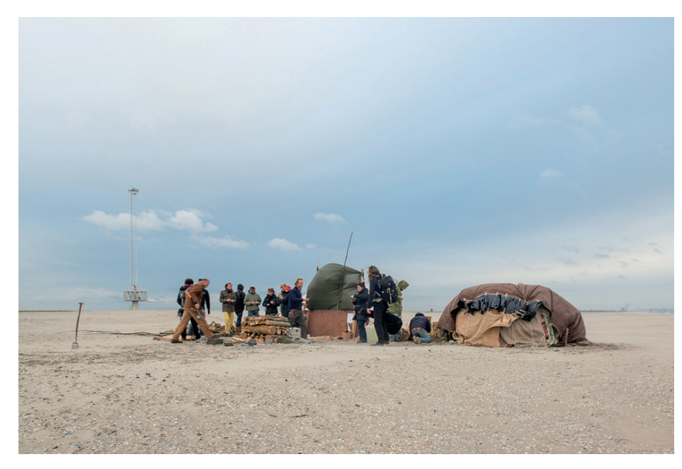
Figure 5. Esther Kokmeijer, Public Expedition Sand Motor #6 Climate Experiment, December 2015, photo Esther Kokmeijer.

The arts can express the spatial, social, and ecological qualities – as well as the problems – of our coastal areas and make them engagingly accessible to the public. These works can transform a destination normally characterised by consumption and recreation into a platform for critical communication and serious reflection. This timely reflection on spatial transition processes may act as a strong catalyst in generating public and professional discussions and connect contemporary research and new works to historic and future works and coastal transitions. Satellietgroep explores the Sand Motor from an artistic perspective and reflects on it in the context of ongoing artistic field research in Scheveningen, polders, the Wadden Sea, Afsluitdijk, and international exchange projects.