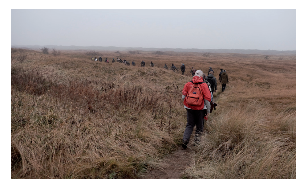
Figure 7. Walking a time line of 10.000 years coastal landscape history, Public Expedition Solleveld & Sand Motor #10 Water Pioneers, December 2016, photo Theo Mahieu.