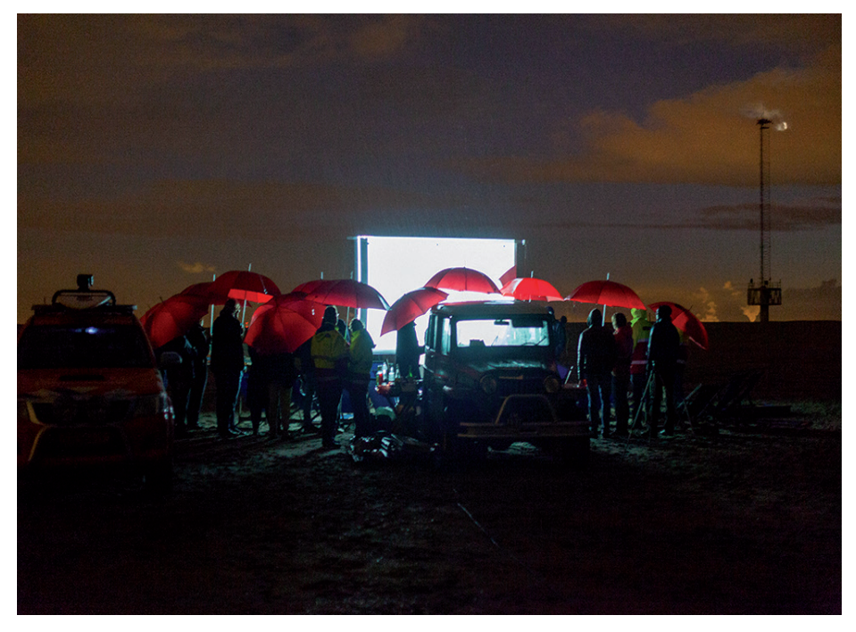
Figure 6. Laboratory for Microclimates, Zand Zicht, Public Expedition Sand Motor #5 CineMare at Sand Motor, September 2015.

policy makers, visitors and residents, young and old, experience something that they will not soon forget. This creates a personal and sensory connection with the public research area, creating an intimate commitment and strengthening the relationship between people and nature. In short, the public program makes the interconnectivity of people and nature accessible and visible. Laymen and experts are thus part of the discourse on sea, ongoing climate change, and coastal transitions. Societal inclusiveness in these developments increases the resilience of people and/with the coastal landscape."