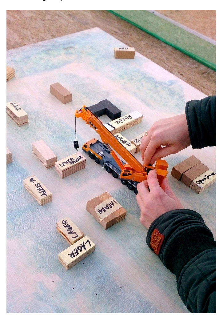
\textbf{Figure 5.} \ \, \textbf{Model to explain spatial flexibility of the PLATZprojekt} \\

The <u>design and spatial organisation</u> of the "container village" is highly inclusive to its users and every visitor: It offers flexibility, allows appropriation and makes clear visually that the project is under constant development. Whenever the given space is no longer sufficient due to new containers arriving on site, a crane is hired and the whole spatial set up is modified to integrate the new containers, as can be seen in Figure 5. If necessary, a new layer of containers can be set up. In addition to these planned changes in the space by tenants, visitors can also spontaneously appropriate space. In this way we can say that the spatial design is never "finished". However, the appropriation of land by tenants can also create invisible barriers when, for example, the adjacent space around a container is transformed into a terrace or "front garden" that seems to belong only to that container.