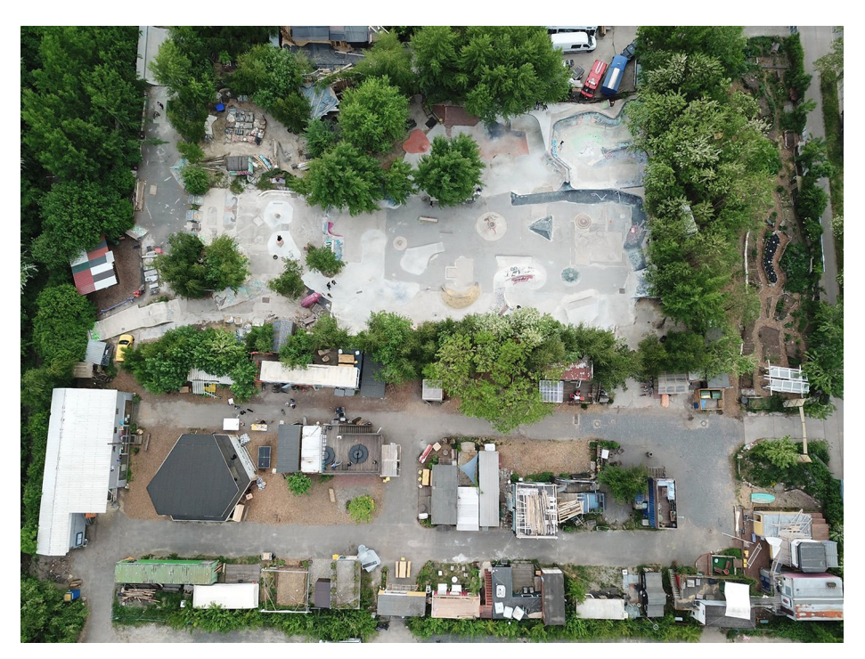
Figure 1. Aerial photograph of the PLATZprojekt, © PLATZprojekt Hannover

To this end, the group worked out a concept and applied for funding to create a container village on the site next to the skate park, whose realisation can be seen on the aerial photograph of the PLATZprojekt (see Figure 1). Funding for their project was granted within the research campaign "Jugend. Stadt.Labor", run by the BBSR. This enabled the project to install the first container as a base station in 2014.