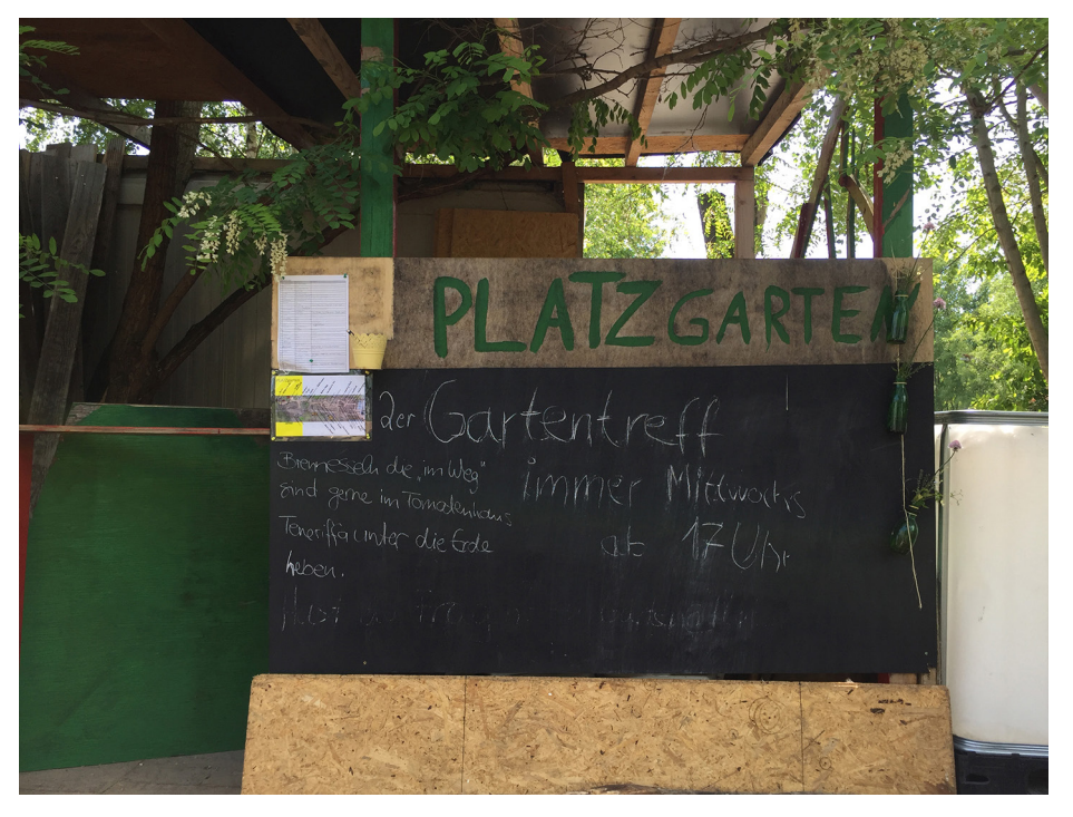
Figure 7. Blackboard for announcements at the PLATZprojekt

commoners regularly organise open days (one in spring and one in autumn) and offer guided tours aimed at attracting and informing interested citizens, neighbours and potential new project pioneers to the site.