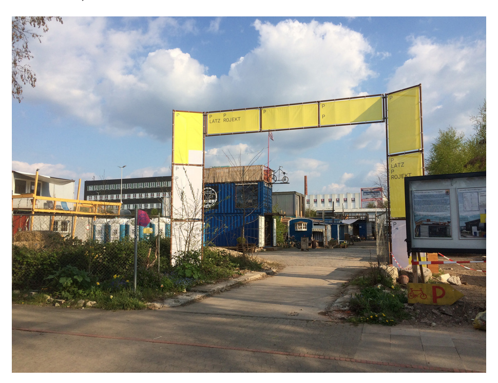
Figure 4. Entrance to the PLATZprojekt

At the same time, for those who know about the project and are interested in dropping by, the PLATZprojekt is accessible to the public at any time of the day. Figure 4 shows the entrance to the site, where the lack of gates confirms the open access to the project and to most of the containers. The entrance is barrier–free and the group is currently working on barrier–free access to all parts of the site, which is maintained by the members of the association, some volunteers and the tenants of the containers.