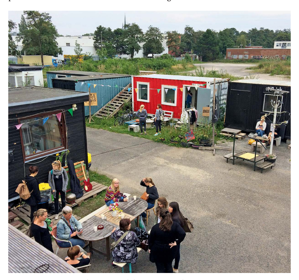
Figure 2. Central Place © PLATZprojekt Hannover

The spatial arrangement of the containers determines the functioning of the site: A central space with community facilities – the "village square" – has been created to encourage people to come together, as can be seen in the photo of the so-called "Central Place" in Figure 2.