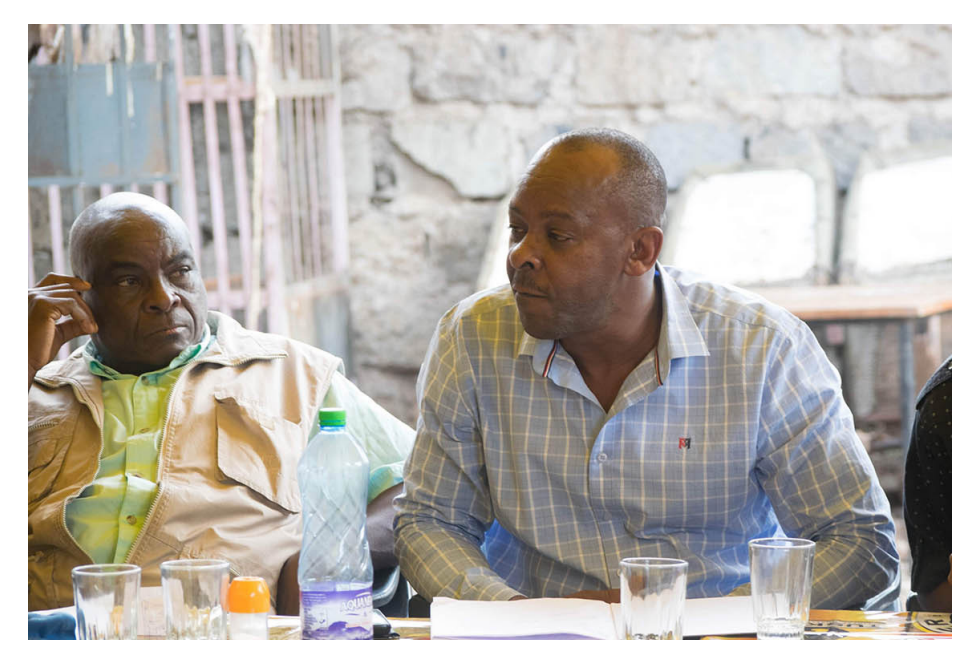
Figure 2. Area chiefs reflect on the local needs of residents near the New Town development of Tatu City, Kenya.

The New Town Lab at Tatu City, Kenya, was co-organized by the International New Town Institute, a "think and do tank" based in the Netherlands, and KUWA, a Nairobi-based research and urban planning office, at the request of Rendeavour, the private developer behind Tatu City. A New Town Lab is a rapid planning workshop in which a selected group of international and local experts work together for one week with the aim of finding a convincing and innovative concept for urgent planning issues. The Lab took place from 9-14 September 2018 and brought together Dutch experts on urban planning, water management, circular economy and spatial design, staff from Rendeavour including Kenya Country Head, Senior Development Manager, Urban Infrastructure Manager, Head of Development Control, and Community Lead, among others. Additional Kenya-based professionals and local residents also participated in the workshop.