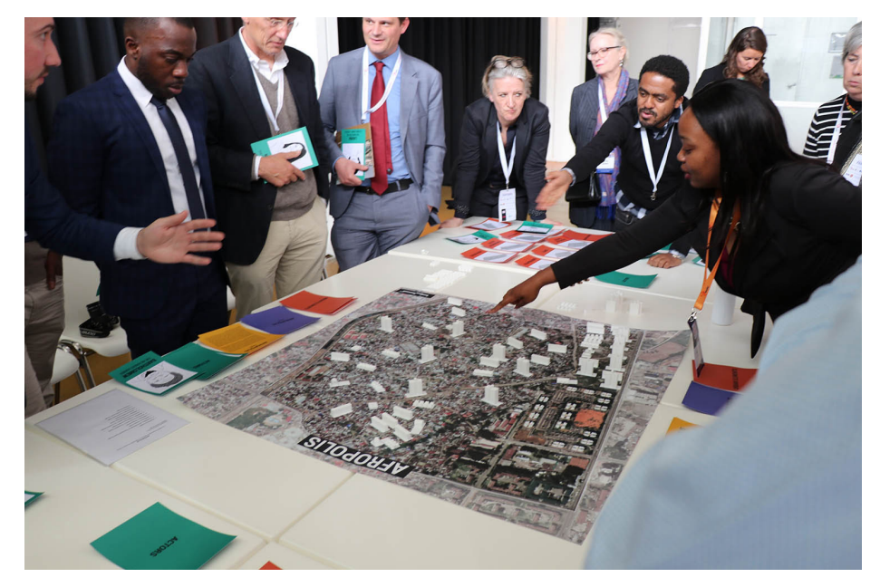
Figure 3. Participants 'play' the serious game Afropolis as a side event at 'Africa Works! 2019' conference in Rotterdam, the Netherlands.

"Afropolis: Co-creating Sustainable Solutions for Affordable Housing in Africa" was held on 8 April 2019 at the Van Nelle Fabriek, in Rotterdam. This workshop was organised by Nelson Mota, Brook Teklehaimanot, Sophie Oostelbos, and Gonzalo Zylberman (TU Delft) and included in the programme of the 2019 Africa Works! Conference, organized by the Netherlands-Africa Business Council. Afropolis was one among fourteen workshops and round-tables offered to the attendees of the conference. The workshop was organised twice, with one occurrence in the morning and another in the afternoon. In the morning session, there were six self-selected participants and in the afternoon session fourteen. In both cases, there was a wide range of backgrounds, including academic researchers, teachers, corporate individuals (e.g. working for developers, contractors and banks), members of NGOs, as well as design and planning professionals.