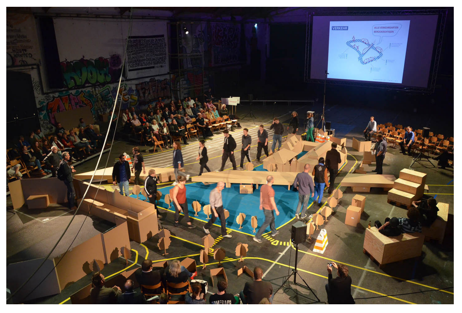
Figure 6. Co-creation Tool: Oversize Model 1-4.

In some cities and universities, the co-creative approach has already been tested and developed as a reaction to people's increased interest in actively changing their living environment. This runs from city walking tours during which people tell planners about local places to dialogue-oriented planning instruments. The latter encompass walk-in urban development models at scale 1:50 to provide a better understanding of planned construction interventions, or 1:1 prototypes in the urban space that enable the direct on-site exchange of information and ideas, as well as digital tools that give a simulated look into the future and provide access to spatial dimensions in urban development for "non-planners".