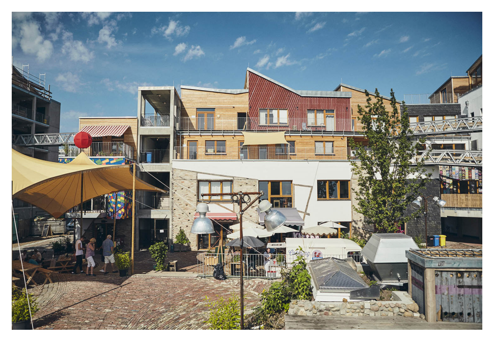
Figure 4. Holzmarkt facades.

-Step-by-step development is possible. The building structure is designed in such a way that construction work can be done gradually, and development completed in clusters. Built units can be supplemented by temporary units to ensure a flexible and dynamic development.