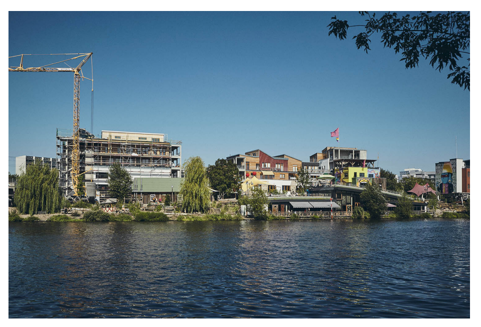
Figure 1. Holzmarkt Berlin.

Due to rising property prices (which had initially stagnated after the fall of the Berlin Wall), the plot of land occupied by "Bar 25" was put up for sale to the highest bidder in 2011. This prompted a largely informal group of users to assume a formal role, becoming an organization with legal capacity (Holzmarkt plus eG 2013). When the land was successfully purchased by a swiss foundation for the Holzmarkt plus eG, the management and planning skills of the team also had to be expanded. The basic qualifications of the users, representing an assorted group of professions (e.g. chefs, joiners, educators and photographers), were no longer adequate from this point on to cope with the financial and planning-related demands of the project. In fact, a recurring characteristic of co-production is the acquisition and expansion of skills by the core team in order to realize an alternative form of property development.