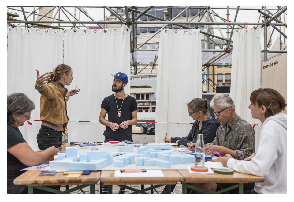
Figure 2. On Site Participation Steintorplatz, Hannover.

The requisite professional know-how is gained in the course of the project autodidactically and with the help of consultants. Development and financing strategies are aimed at acquiring land, ensuring stable rent and lease agreements, and establishing cooperative or hereditary leasehold models. As the project proceeds, their status changes from users to owners, administrators and operators. In the process, they bring life to, use and combine dormant resources. This ranges from the recycling, upgrading or indeed upcycling of existing physical stock as well as non-material resources such as personal commitments of work and time. Thus another resource of user-based urbanism can be described as the social capital invested by the actors involved.