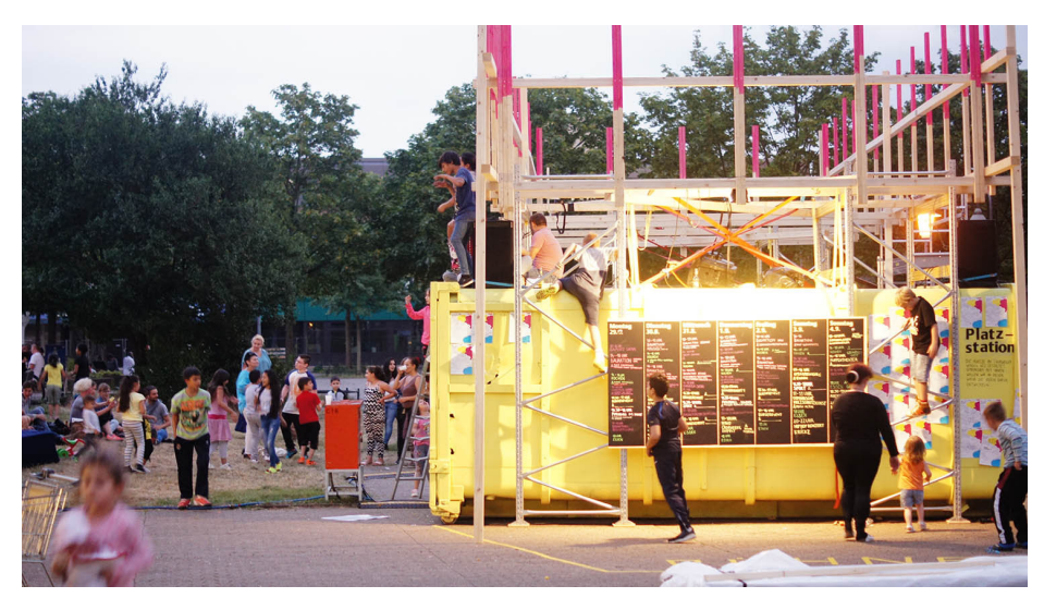
Figure 7. Cocreation: On-site Participation "Platzstation" in Cologne Chorweiler.

Co-production often develops due to pressures from civil society, in particular activists, and is certainly also a process that has the potential for conflict. Consequently, the negotiation and planning processes are not always harmonious (Watson 2014).