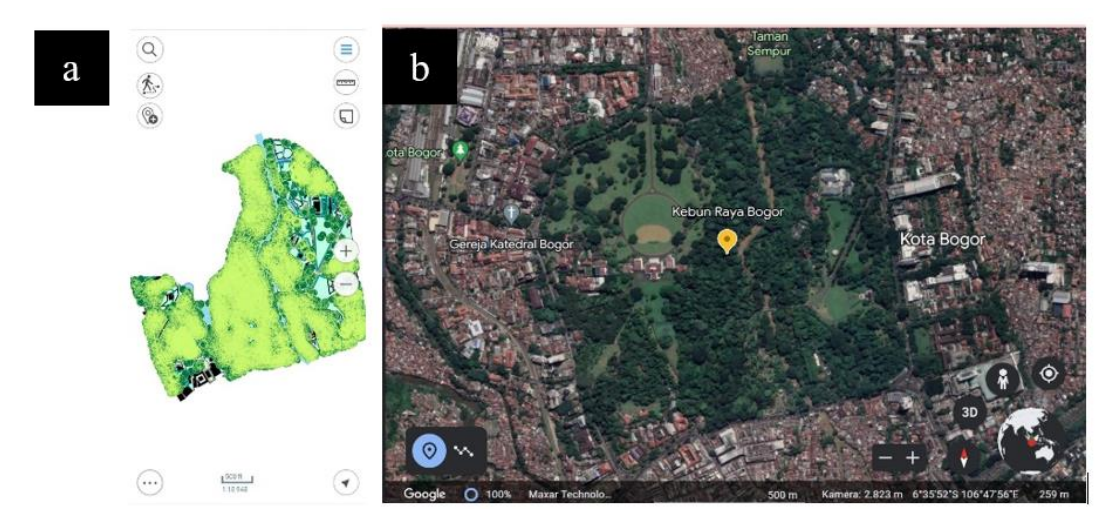
Figure 1. The map showing the study sites at Bogor Botanic Gardens

There are six species of the genus Etlingera in Bogor Botanic Gardens (Table 1). Six Etlingera species are rhizomatous herbs that grow in the wet tropical biome (Ariati et al., 2019; Olander, 2019; Olander, 2020; Poulsen et al., 2009; Poulsen and Olander, 2019b; Poulsen and Olander, 2019a; Poulsen et al., 2019; Saw, 2019). All species of the genus Etlingera in Bogor Botanic Gardens are native to the region of Malesia, according to the