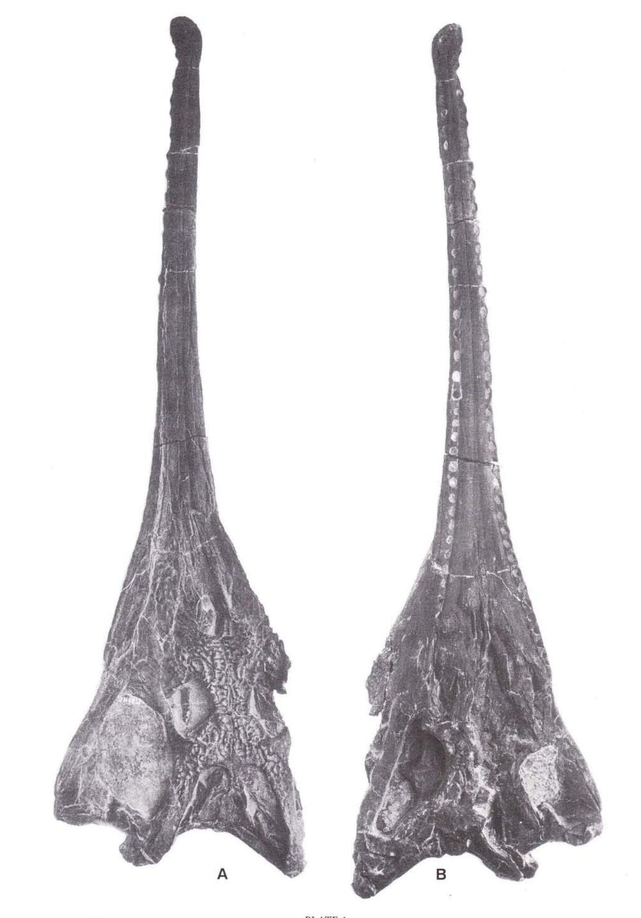
PLATE 1 Fig. 1 - Mystriosuchus planirostris, isolated skull; A) dorsal, B) ventral views. The entire length of the skull is 71.5 cm.