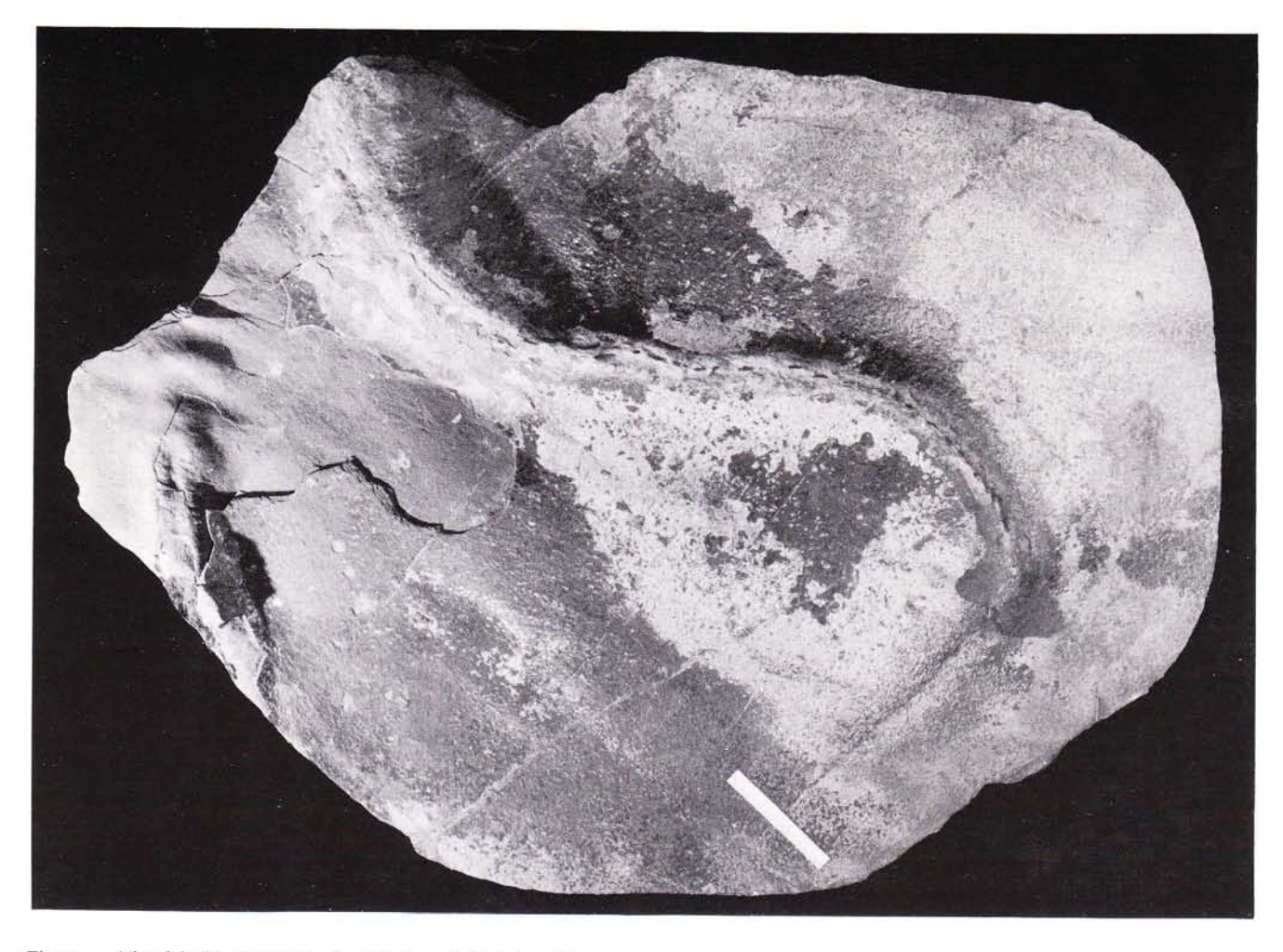
Fig. 2 - The slab (block 4 in fig. 1) with the tail. Scale-bar: 15 cm.

to those of thalattosaurs and their life environment is in agreement with the paleoenvironmental reconstruction of the Calcare di Zorzino.