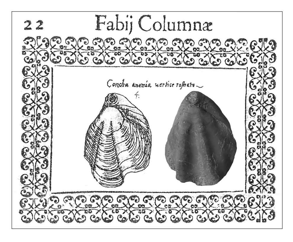
Fig. 3 - The specimen illustrated in figure n.4 by Colonna (1616) together with a typical Miocene T. sinuosa specimen coming from the Stirone River section.

Such individuals were recognized as T. sinuosa in Seguenza (1865, 1870, 1871) and Taddei Ruggiero (1983), and as T. calabra in Gaetani & Saccà (1983) and García-Ramos (2006). The presence of such a sulciplicate anterior commissure was considered part of the morphological variability of T. terebratula by Lee et al. (2001). However, it is important to consider that these forms lack the long and prominent fold on the ventral valve which is present in T. sinuosa. We deem it is probably incorrect to keep considering these specimens as synonyms of T. terebratula, yet they clearly do not belong to T. sinuosa and therefore deserve further study. The same holds true for Terebratula costae. The extensive collections for these forms including the specimens studied by Costa (held at the Museum of Paleontology in Naples), the collection of Seguenza (held at the "Gemmellaro" Museum in Palermo), and the possibly conspecific sample from Aguilas (Murcia, Spain, García-Ramos 2006) deserve further analy-