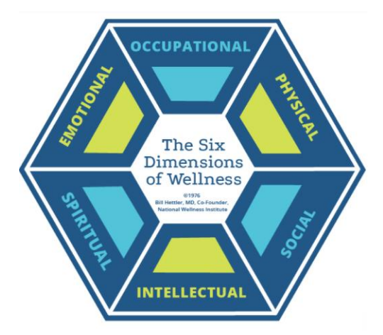
Figure 1. Hettler's (1984) model of holistic wellness

The current study is underpinned by Hettler's (1984) model of holistic wellness which was developed to promote wellness in the university community settings.