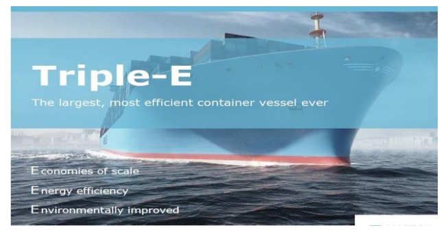
Fig .2. TRIPLE-Class