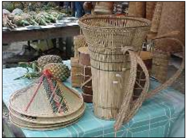
"Sirung" or Hat and "Wakid" or backpack made by rattan and bamboos.