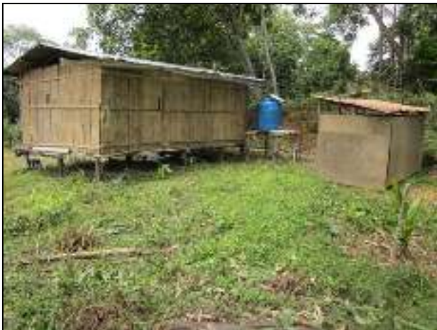
A bamboo house.