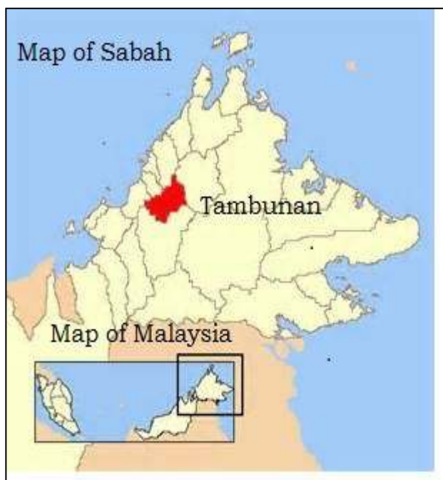
Fig. 1. Map of Sabah showing Tambunan district. (Source: Map Land and Survey Kota Kinabalu).

Sabah, 28,417 sq mi (73,600 sq km), is a state in the easternmost part of Malaysia and the northernmost part of Borneo Island, ca. 287,000 sq mi (743,330 sq km), largest of the Malay Archipelago and third largest island in the world, South West of the Philippines and North of Java. Being the second largest state in the Federation of Malaysia after Sarawak, Sabah has a total land area of about 7.4 million hectares whereby more than half of the land or 4.7 million hectares are forested area that is rich in biodiversity (Kulip, 2004). A total of 3.21 million of people was found in Sabah as the result of Census 2010 by Department of Statistics, Malaysia.