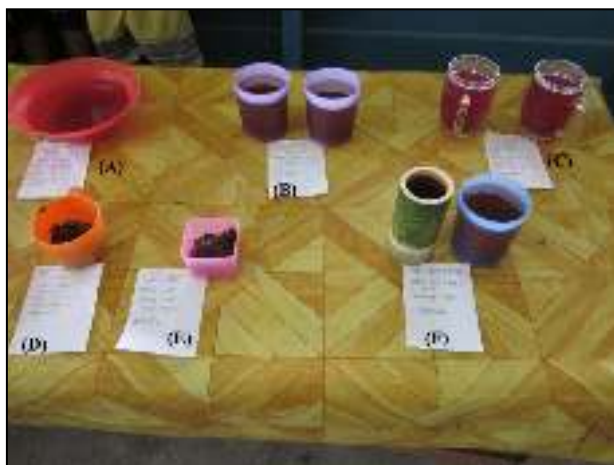
(b) Extracted eg. tea prepared (A) “Tubat Onginan” for flatulence and fever (for bathing), (B) “Tubat Dayang Mato” for muscle cramp (for drinking), (C) “Tubat Tawak” for back pain (for drinking), (D) “Tubat Totud” for knee (for plastering), (E) “Tubat Kupes” for boils (for plastering) and (F) “Tubat Owingkat” for newly mothers (for drinking).