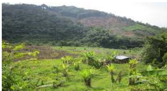
Fig. 3. View of Tikolod village. Cultivated land with padi, banana and other vegetables. Far behind is secondary forest and newly opened land for planting hill padi.

According to a census carried out in 2010 by Malaysia Department Statistics, Tambunan population was about 30,529 people, of which the Tambunan Dusun tribe is the majority. There were seven sub-tribes, namely Tuwawon, Tagahas, Tibabar, Bunduh, Gunnah, Palupuh and Kohub, in the early 20th century but only three sub-tribes, Tuwawon, Tagahas and Tibabar, are left now (Low, 2006). They cultivate mostly wet padi rice on the plain and some hill padi rice on hilly and mountainous areas. The people of Tambunan have used a lot of bamboo resources especially 'Poring' bamboo or Gigantochloa levis , in their daily lives since the 1800s. This can be seen by the fact that most of the old houses that are still exist are constructed by bamboo materials and the western part of Tambu-