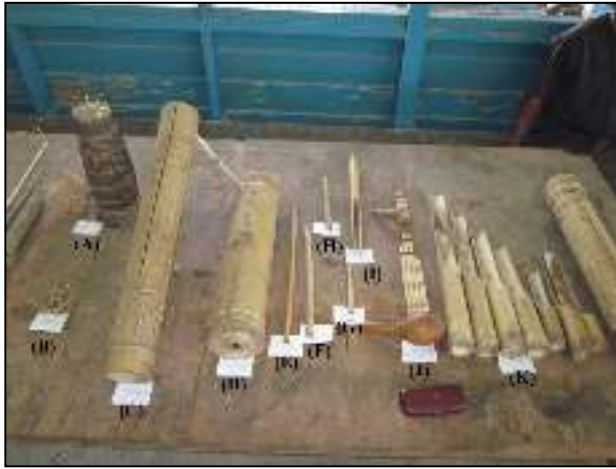
Various type of traps and local musical instruments. (A) "Bubu" or Fish trap; (B) "Sodik" or small mammals trap; (C) "Tongkungon" or Bamboo guitar; (D) "Tongkubong" or Bamboo Xylophone; (E) "Turali" or Nose flute; (F & H) "Suling" or mouth flute; (G) "Bungkau"; (I) "Babanggu", (J) "Sompton or mouth organ; (K) "Togungak".