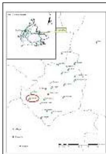
Fig. 2. Map of Tambunan District showing locality of study in Tikolod Village (in red circle).

There are several published reports on ethnobotanical studies which were conducted in