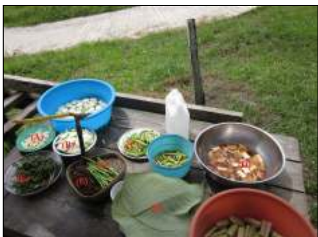
(a). Forest vegetables/greens (A) Mangga or Mangifera indica , (B) Toonsomon or Cucurbitaceae, (C) Tayaan or Limnocharis flava , (D) Polod or Arenga undulatifolia , (E) Kangkung or Ipomea aquatica , (F) Lemiding or Stenochalena palustris , (G) Sokoh Tombotuon or Schizostachyum lima and (H) Wongian or Macaranga sp. (This is not a vegetable but is used to warp cooked rice).