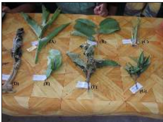
(a). Raw materials eg. leaves of (A) Topu or Etlingera elatior , (B) Kaliabas or Psidium guava , (C) Segumau or Cymbopogon citratus , (D) Kebong or Saurauia sp., (E) Limau or Citrus aurintifolia , (F) Tawaweh or Blumea balsamifera and (G) Tembiau Taragang or Justicia gendarussa .