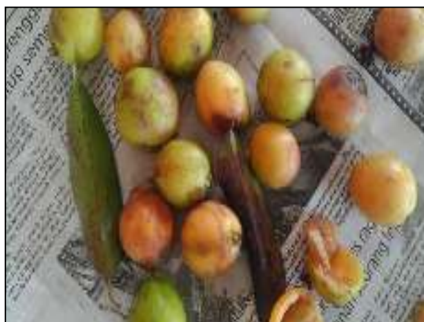
(b) Forest fruit eg. Takob or Garcinia sp. (Guttiferae)