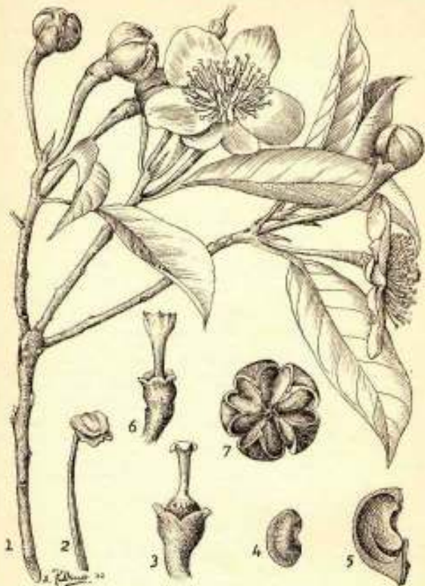
FIG. B. Schiwa waUichii : 1, twig with leaves and inflorescence, 1 x; 2, stamen, 5 X; 3, calyx with pistil, 2 X; 4, seed, 2 X; 5, valve of fruit, showing septum loosening from lower half of fruit-wall, 2 x; 6, calyx and central columella of fruit, 2 x; 7, open fruit from above, 15 x; all, subspecies noronhae , var. noronhae . — After living material cultivated in Hortus Bogoriensis, V.L.C. 91.