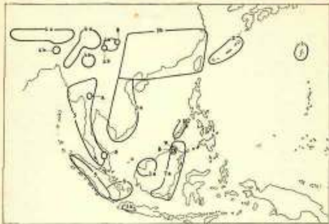
FIG. A. Sckima wallichii , distribution areas of the subspecies and varieties: 1, subsp. mertensiana ; 2, subsp. liukuensis ; 3a, subsp. noronhae var. noronhae ; 3b, subsp. noronkae var. superba ; 4a, subsp. wallichii var. wallichii ; 4b, subsp. wallichii var. khamana ; 5, subsp. oblata ; 6, subsp. bancana ; 7a, subsp. crenata var. crenata ; 7b, subsp. crenata var. pitlgarensis ; 8, subsp. monticola ; 9, subsp. brevifolia .