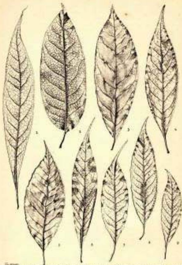
FIG. D. Sakasa wallichii , leaf-shapes, lacinate fruct below, 6.5 \times ; all stip. punctate var. uvosulca . — After Koorders 41931; (1); Boeker 17071 (2); Bakhuizen van den Brink 1271 (3); Koorders 8284; (4); Koorders 12138; (5); Ja.5681 (6); Koorders 11341; (7); Bakhuizen van den Brink 4113 (8); Koorders 8259; (9).