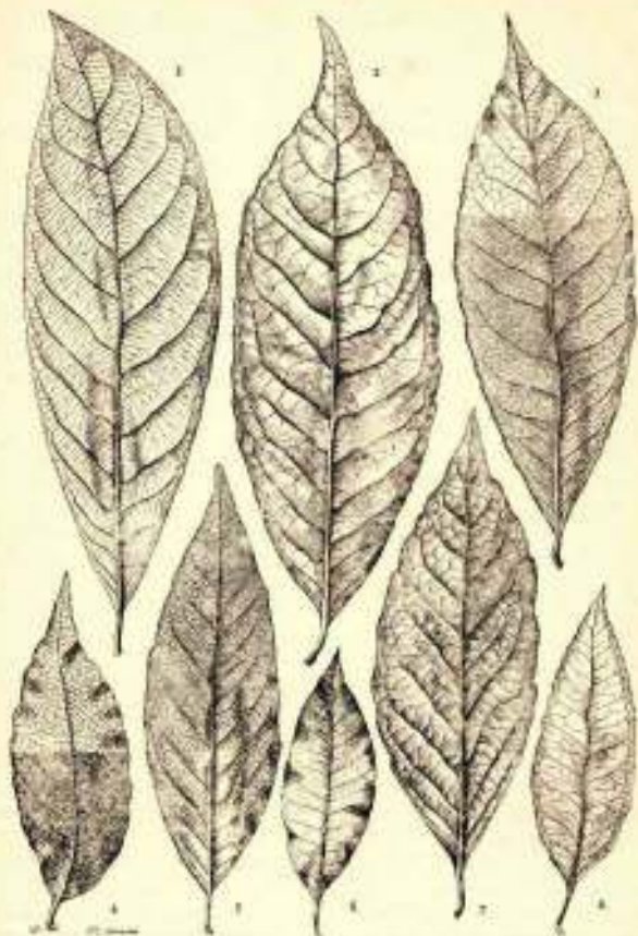
FIG. G. Schima wailichii , leaf-shapes, laminae 1—5 and 7—8 from below, 6 from above, 0.5 X 1—5 and 7—8 subsp. oblata ; 6, subsp. noronhut : var. norovhae . — After bb.15548 (1); S.W.K./I-18 (2); bb.622(5 I.S.); Teysmann 655HB (4); bb.B196 (5); Lorzing B747, cultivated (C); bb.6435 (↗); bb.5479 («).