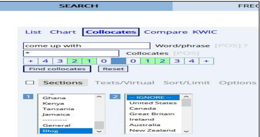
Figure 4.2 Searching 'collocates' function in the GloWbE corpus for the prepositional verb come up with