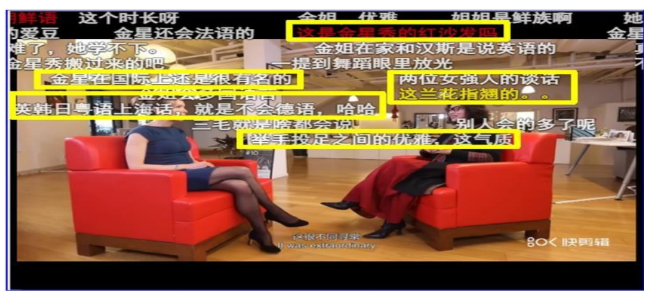
Figure 1 . Danmus as the Scrolling Marquee Comment in Bilibili Video Delivered by Chinese Netizens

English. Consequently, a number of viewers used Danmus to comment Ms. Jin Xing's English language.