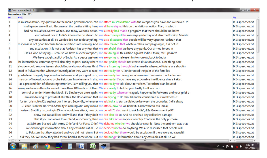
Figure 2 The Concordance of the use of Pronoun 'We' in Imran Khan's Speeches

The research shows that both the premiers of India and Pakistan have used the pronoun 'we' very tactfully to show their sincerity for the general masses as well the government. Using this technique, they have tried to capture the minds of audiences to manipulate their ideologies and to get their support