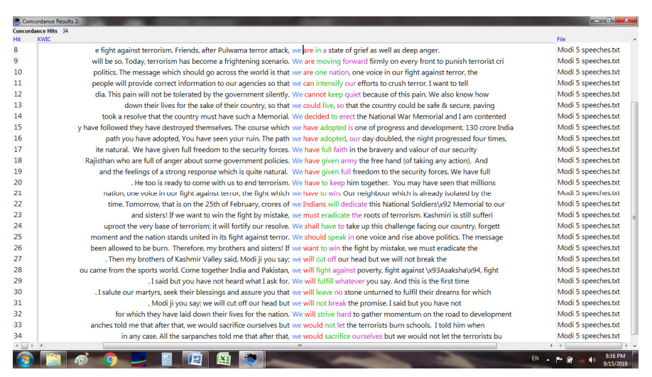
Figure 3 The Concordance of the Use of Pronoun 'We' in Modi's Speeches

The research shows that the addressees of Modi are the people of his country i.e. general masses, media, and his opponent political parties. He has used the pronoun 'you' very tactfully to control the minds of people of his country to manipulate his ideologies, motifs and political aims. The table 4.1 shows that the pronoun 'you' has been used by Modi more than Imran Khan with a percentage of 0.85 % and 0.81% respectively. This shows that Modi has the main focus on his audiences and uses language consciously to attract the attention of his audience. It has been suggested that 'you' is not used forever to analyse practical experience; rather it is used to discuss 'conventional wisdom' instead. In this way, 'you' is used to articulate common sense or truth commonly admitted, with the hope of offering the audience's agreement (Allen, 2007).