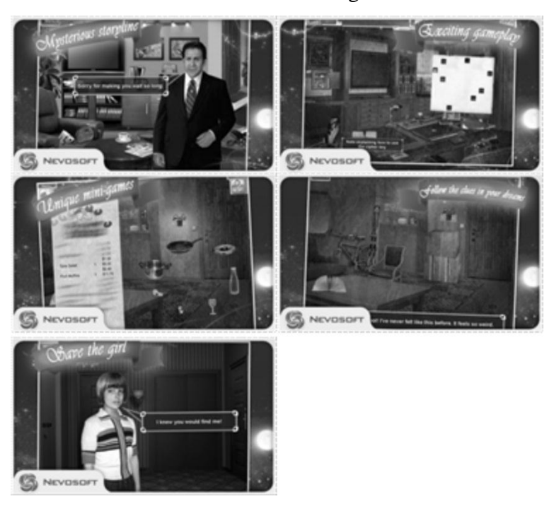
Figure 2: "Dream Sleuth" Screenshot

The game used in this research was "Dream Sleuth". The game was comprised as adventure, point-click, and hidden-object game. This game used as an intervention for five-meeting research.