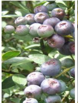
Berries in the process of development, they begin to form anthocyanin pigments