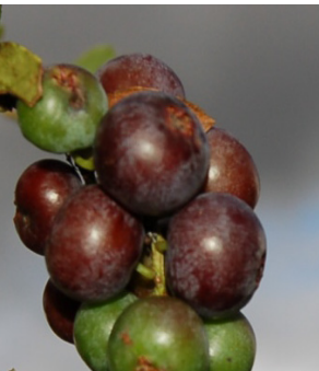
25% of the bunch berries have reddish anthocyanin colorations, covering 50 to 75% of the epicarp of the fruit