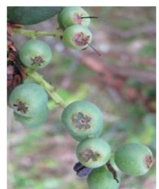
The berries are in elongation; they are green fruits of variable size.