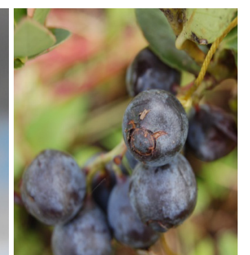
100% of the epicarp of the bunch of berries is purple, as a result of the content of anthocyanin pigments that make them up; In addition, they can be harvested periodically.

Figure 6. Stage of development of the berries (BD) subdivided into 4 phases, from the beginning of the fructification to the harvest. Adjusted by Hernández et al. (2012).