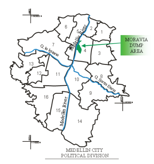
Figure 1. Localization of the Moravia dump in Medellín, Colombia.

Site description. The Moravia dump (6° 13′ N, 75° 34′ W) is situated approximately 40 m from the Medellín river margin (Figure 1) and operated from 1970 to 1984, receiving about of 100 ton/day of industrial, domestic and medical residues (Integral, 2000). This area became progressively inhabited and by the end of 1983 more than 17.000 people were living there, with 1.013 families still residing there today.