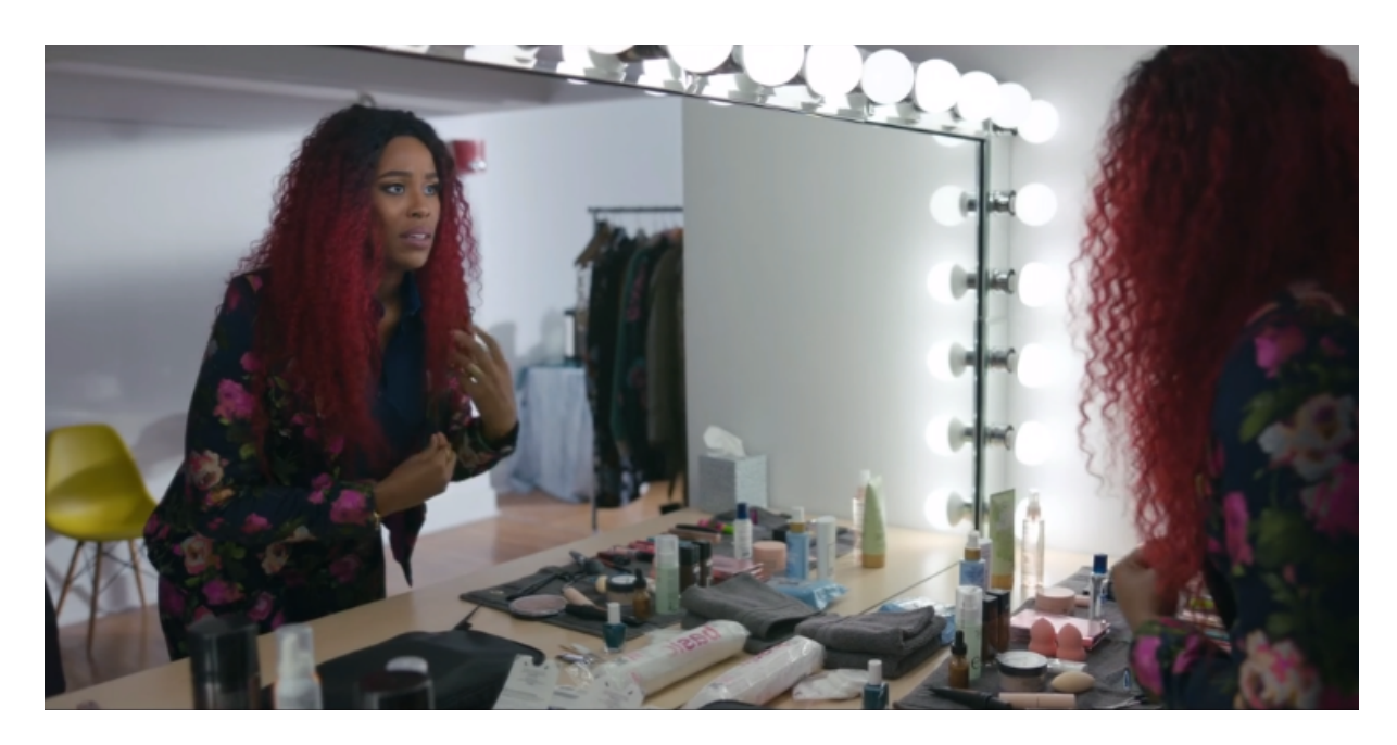
Figure 4 Tye wearing "Trina" and repeating her mantra, Harlem (season 1, ep. 4).

Tye repeats to herself out loud as a mantra, "I am not my hair. My hair doesn't define me. I am not my hair. My hair doesn't define me" (fig. 4).