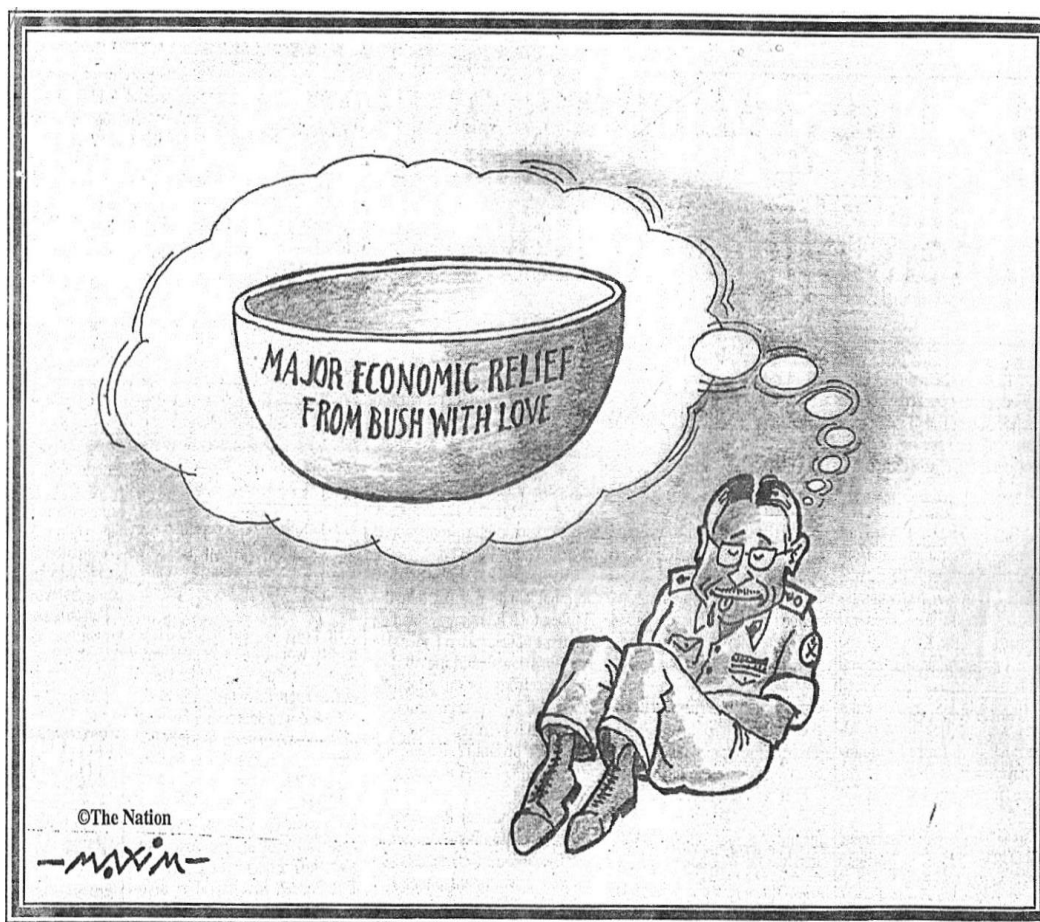
Figure 3 taken from daily 'The Nation' Dated: 16-11-2001

In figure 2, settings include people and objects set against plain background. The setting that is denoted shows a cloud and currencies. What is connoted is the rain of currencies. Here, the salience is given to the cloud producing abundant money that fades the participant into the loads of money. The cloud is very important here for its association. It serves to foreground the ecstasy of the participant fully covered with numerous falling currencies. In terms of semiotic choices, the participant's concern is represented through rain which is the sign of blessings. So, in the image the rain of money is the greatest blessing for him. The empty setting evokes the idea depicted more through the actor and objects. The abstraction reveals that ideological work is being done. As Fairclough (2003) explains, whenever abstractions replace actual places, actions and persons, it indicates about the ideological work.