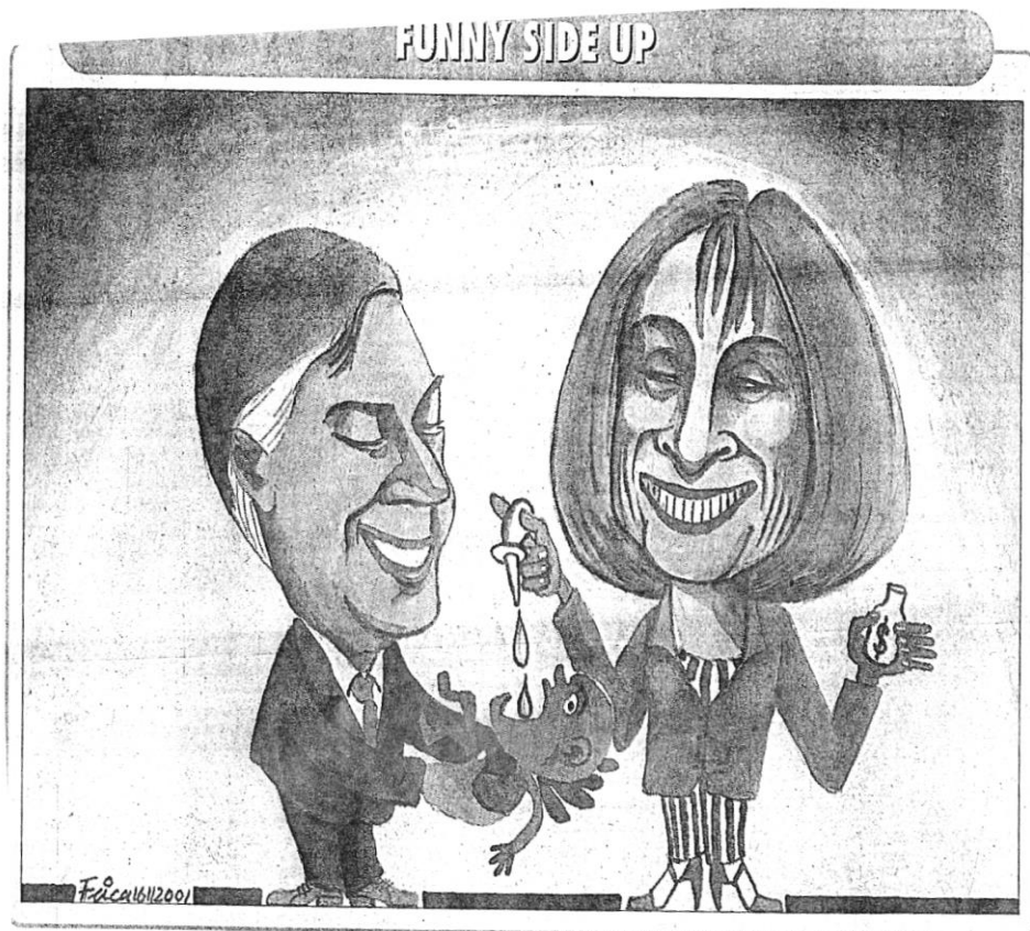
Figure 1 taken from daily 'Dawn' Dated: 17-11-2001

The action connotes the injection of Pakistan's economy by the US dollar to improve its health. The smiling faces of both Aziz and Chamberlin suggest their pleasure while performing this act. The child seems very weak and feeble and needs to be properly fed in order to gain good health. Aziz and Chamberlin are wearing formal suits and represented as professionals. Their hair are well styled and combed. This look helps to reinforce professionalism, formality and seriousness of the mission. It implies that the dollar deal is done and they are agreed upon the plan. The size of participants' heads is bigger than body and Chamberlin looks taller than Aziz. Her size draws our attention to the power and significance. Aziz is bent and seems obedient and compliant.