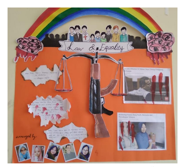
Figure 2 - A Class Poster on Law & Equality

Another strategy was poster presentation. Each class was divided into six groups with different topics to address, they were: law & equality, feminism, poverty, discrimination & racism, stereotyping, and ethnocentrism. One of the members presented the poster to the members of the other groups while the rest of the groups visited other posters. They learned from their peers on the topic of the poster that was highly related to peace education. Below is a sample of the students' poster.