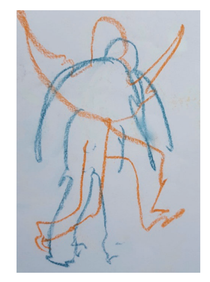
Figure 3. Patient's 4 perception of the pump.

The pills taking routine was replaced by the pump cleaning, activation and deactivation routine, which is carried out by the patient's husband. He explained that each