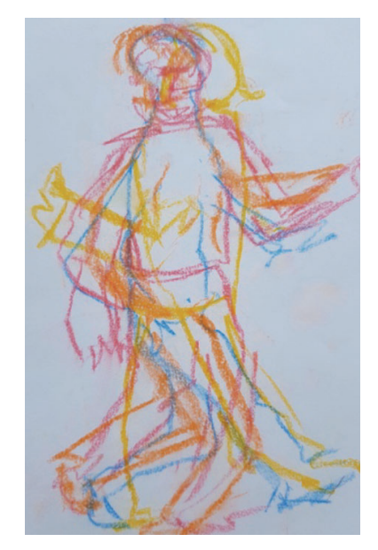
Figure 1. Patient's 4 perception of PD.