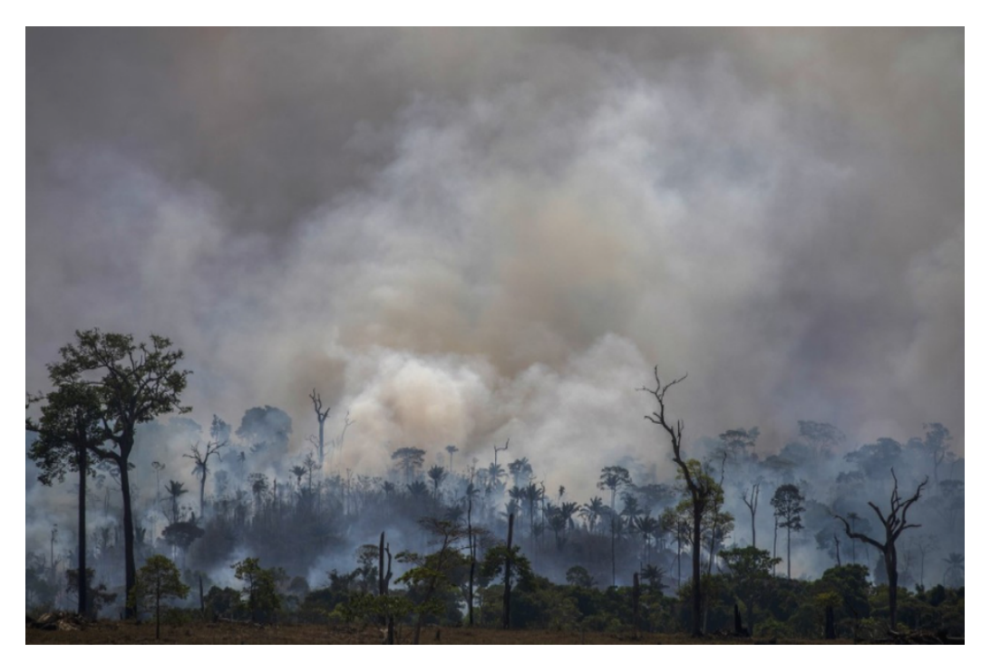
Figure 2 – Burn in the Amazon, in the municipality of Altamira (PA).

Geotechnologies have made it possible to observe the planet as a whole and in a systemic way, giving rise to a common sense of respon-