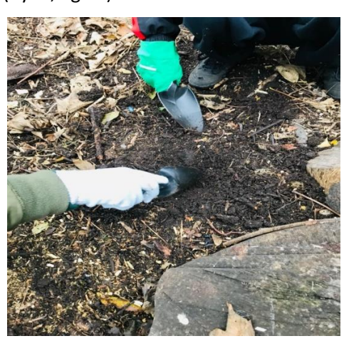
Figure 10: Area to dig

"That's my area to dig. My buried treasure is there." (Ryan, age 9)