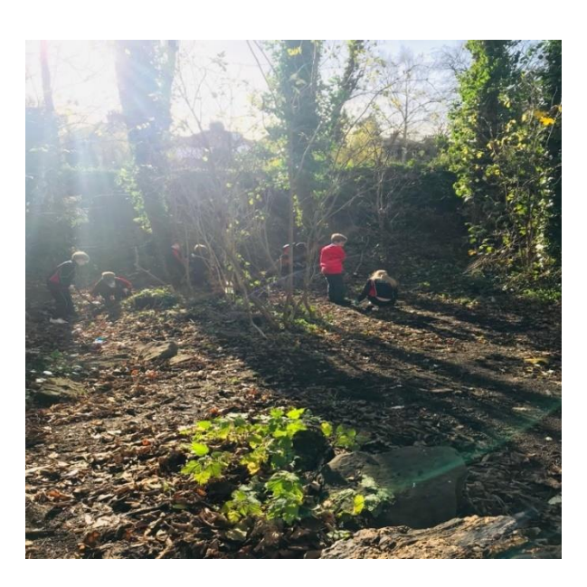
Figure 6: Sun through the branches

"I love the way the sun is shining through the branches of the trees. It looks magical." (Emily, age 8)