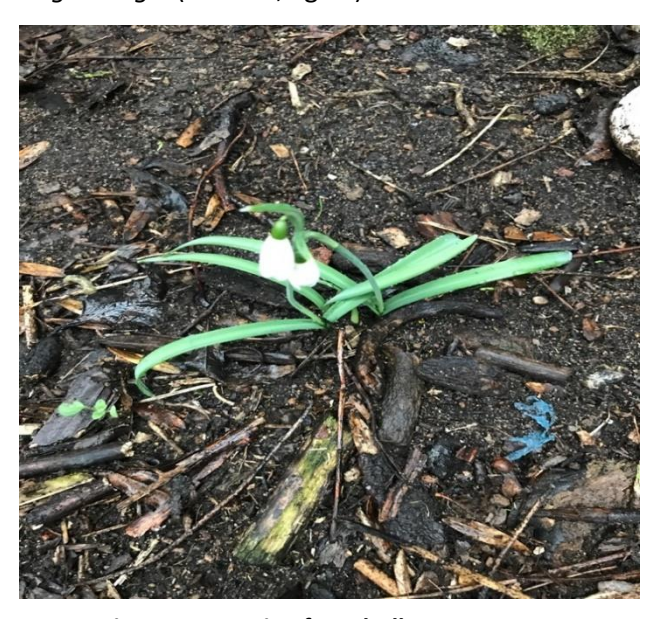
Figure 5: Growing from bulbs

"We did some digging here so that we could plant bulbs. I like to come back each week to see how they are growing." (Maltida, age 8)