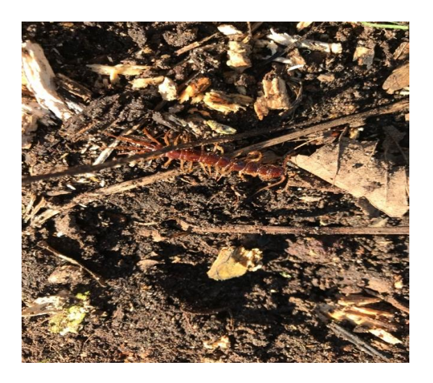
Figure 2: Centipede

"This is a centipede. You can tell by its shape and number of legs." (Macy, age 7)