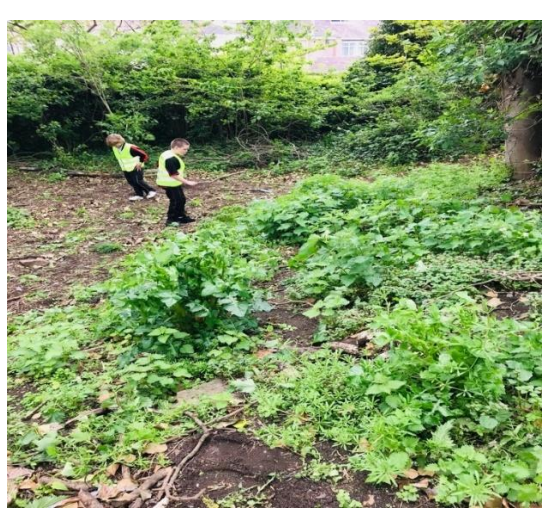
Figure 7: Forest School area

"I tried to take a photograph that captured all of our Forest School area, but I couldn't fit it all in." (Ryan, age 10)