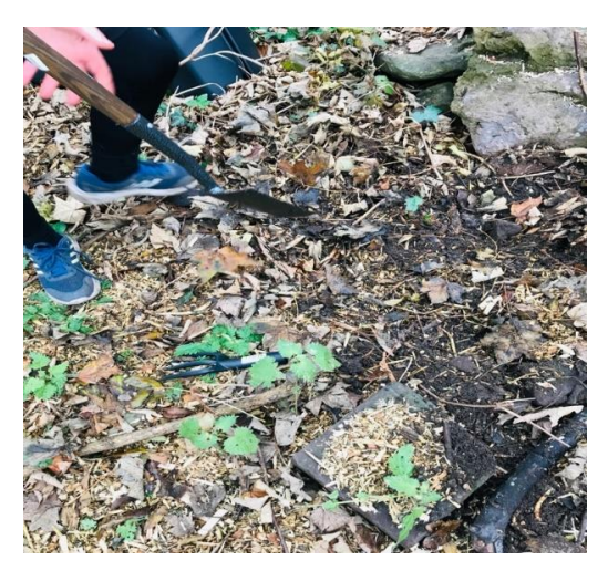
Figure 8: Digging for treasure

"Emily and I found coins buried in the soil. It's our secret treasure. We are buried it again after taking the photograph so that the coins remain in Forest School. It means we can play with them next time." (Rachel, age 8)