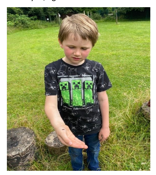
Figure 4: Bee

"Bees live in our Forest School. It was hard to capture one in a photo, but I managed. I used to be scared of bees but now I know how good they are for the flowers." Ryan, age 9